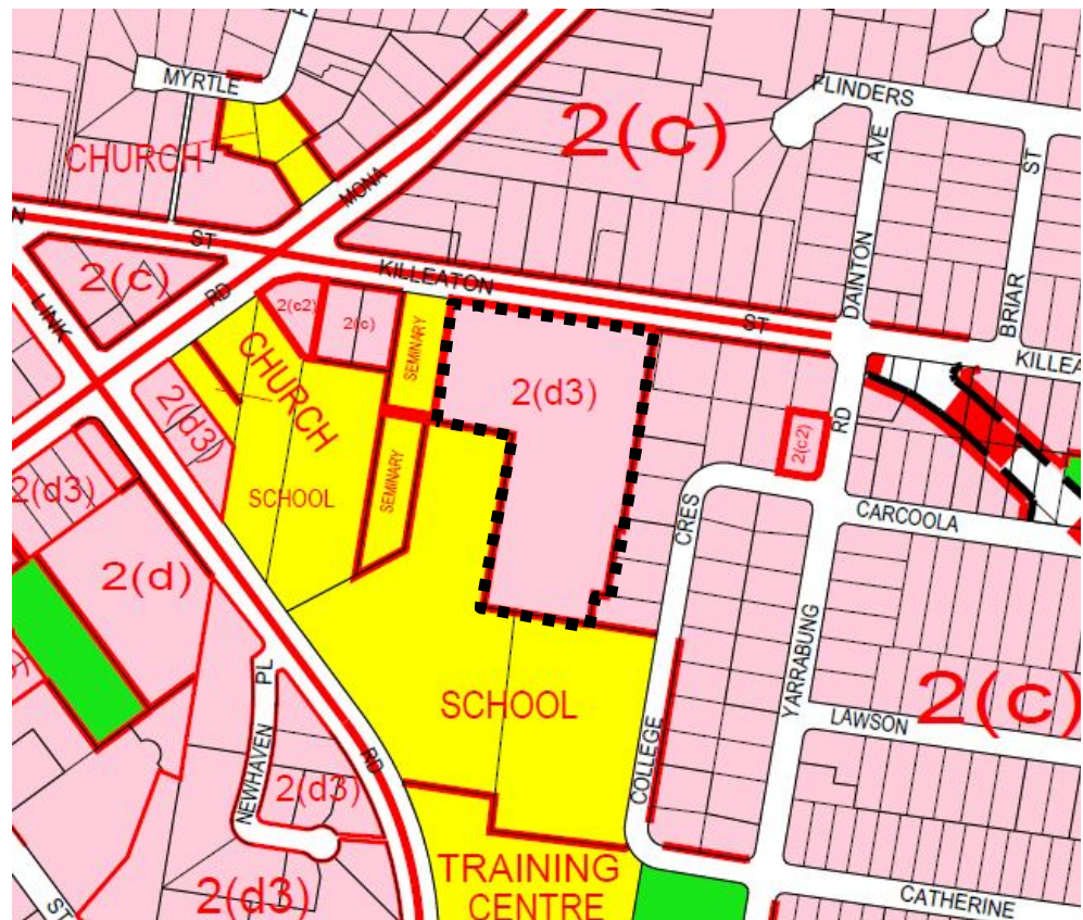
Figure 3: Zoning of the subject site (shown dotted outline)

The site is zoned Residential 2(d3) under the Ku-ring-gai Planning Scheme Ordinance (KPSO). An extract of the zoning map is shown in Figure 3 below.