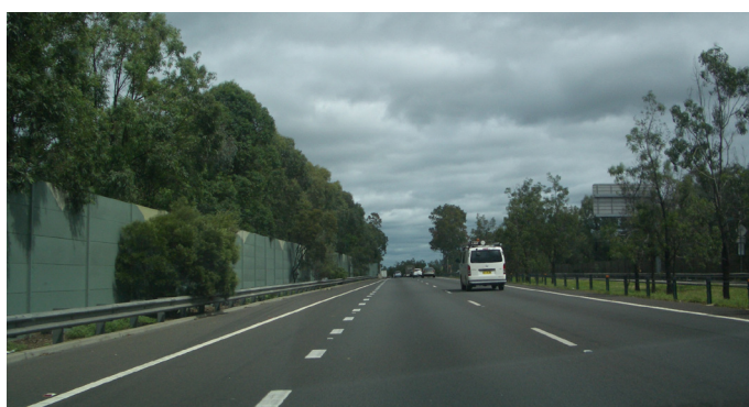
Illustrations 29 - 31:

Character images of the Gibson Avenue to Queen Street precinct: View west showing embankments vegetated with Cumberland Plain Woodland, vegetated median, and the noise wall abutting the carriageway