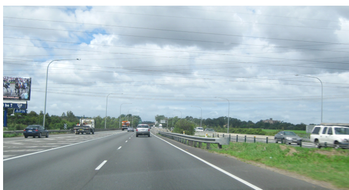
Illustrations 21 - 23: Character images of the Salt Pan Creek Floodplain precinct: the view west, view north over the floodplain and adjacent industrial area, the expansive view east