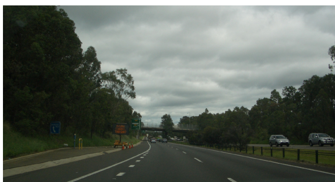
Illustrations 25 - 27:

Character images of the Salt Pan Creek to Gibson Avenue precinct: view west to Fairford Road interchange, west of Fairford Road showing vegetated embankments, and view west to Gibson Avenue showing trees and shrubs in the median