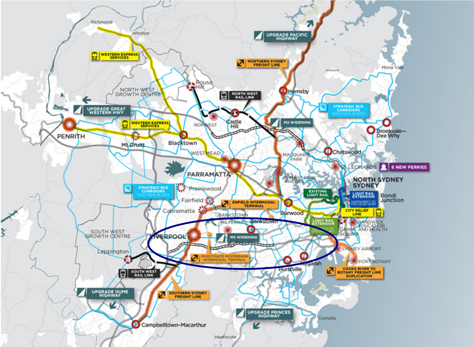
Figure 1.2: M5 Corridor in the context of the Metropolitan Transport Plan