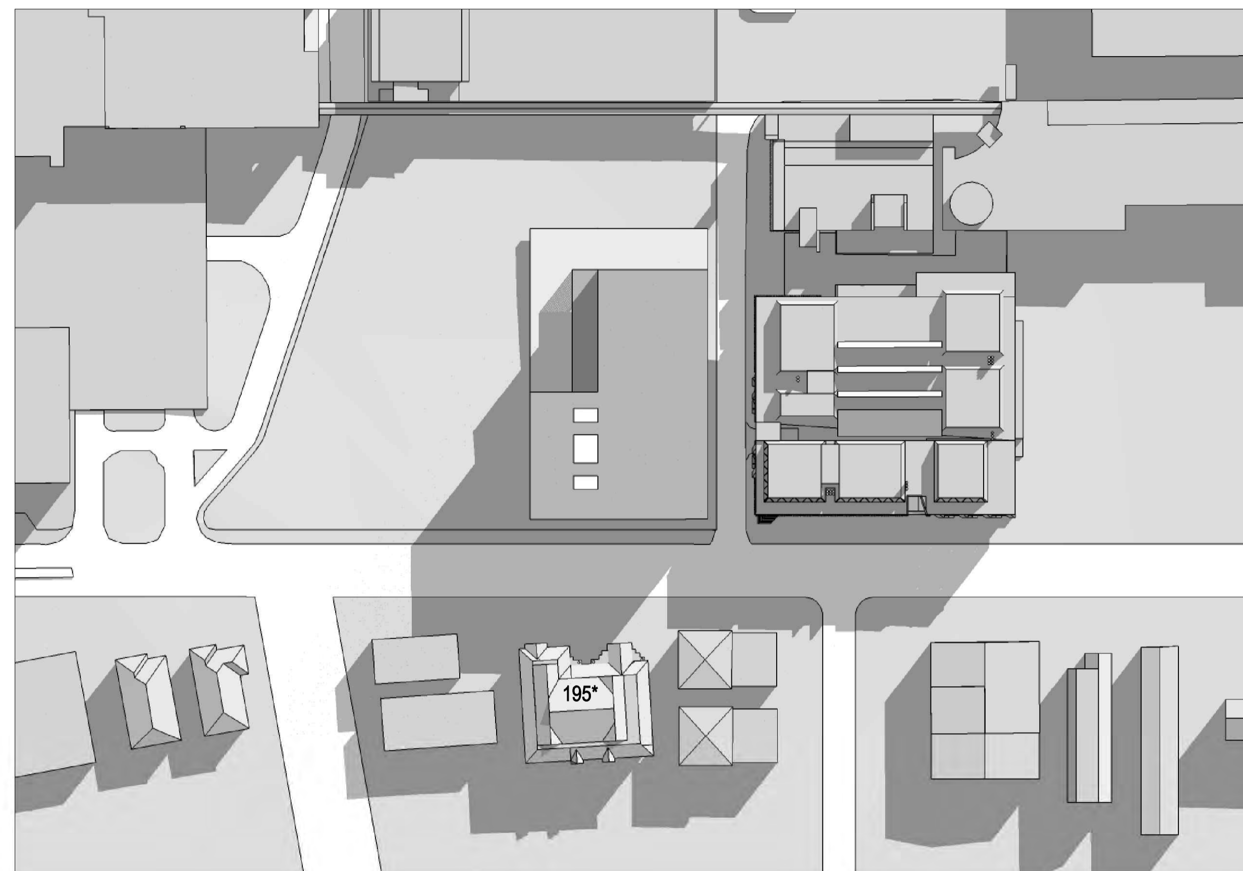
* SHADOW IMPACT AT 195 HAWKESBURY ROAD GROUND FLOOR CARPARK ONLY