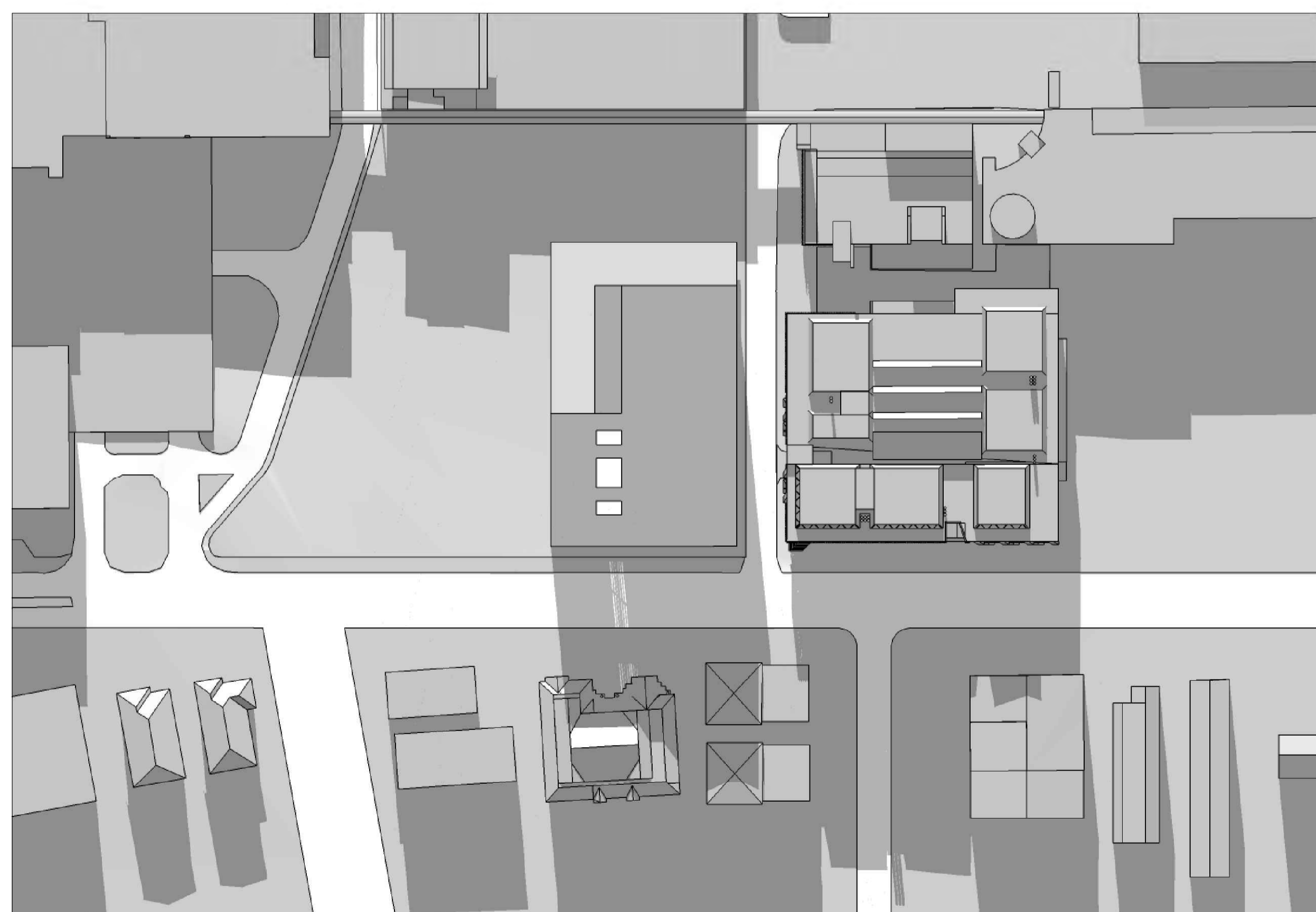
JUNE 21 - 3:00 PM