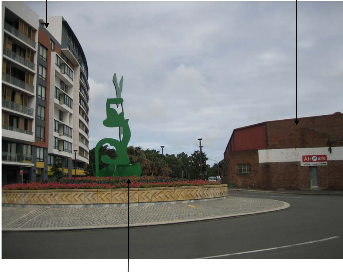
Existing public art at entrance to Discovery Point & Wolli Creek precinct