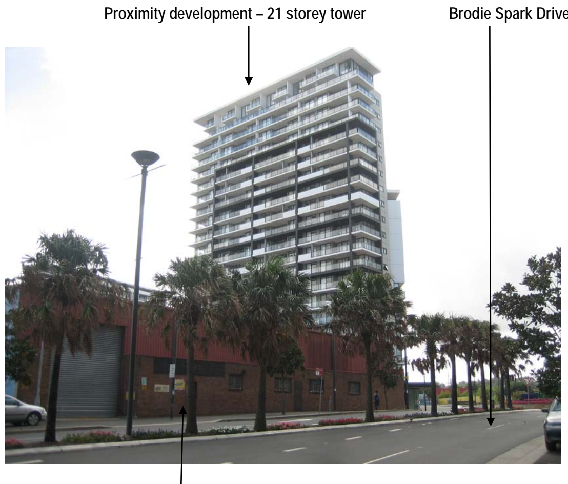
Figure 8: View of adjoining Multiplex tower development ‘Proximity’ from Brodie Spark Drive with “NAHAS Construction” site in the foreground

Adjoining the site to the south is a mixed use development known as “Proximity”, (refer to Figures 8 and 9 ) which was developed by Multiplex. The Proximity development comprises around 290 apartments with a maximum building height of 21 storeys. Stage 1 of the development has been completed and includes ground level retail fronting Magdalene Terrace and Arncliffe Street.