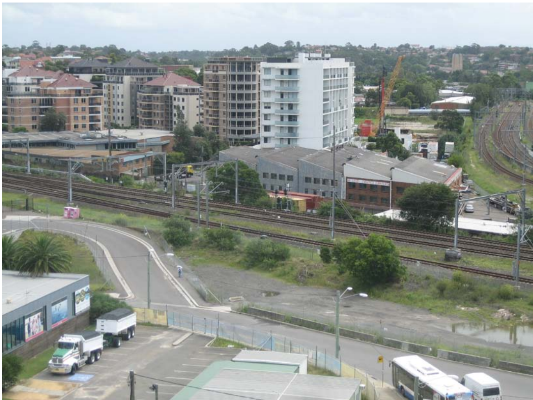
Figure 12: High density residential development located to west of Discovery Point site