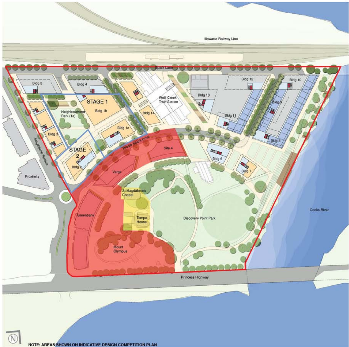
Figure 14: Areas subject to Concept Plan and Stage 1 and Stage 2 Project Applications