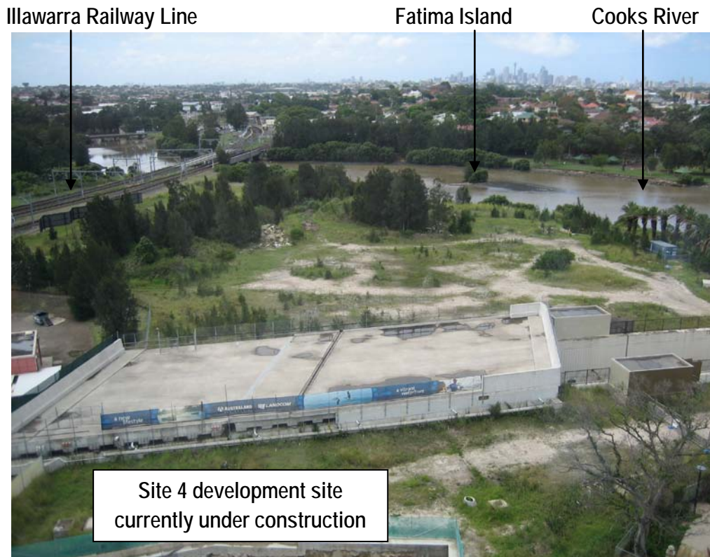
Figure 5: Northern part of Discovery Point site with rail corridor in foreground