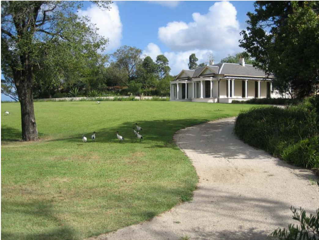
Figure 3: Tempe House with Discovery Point Park in the foreground