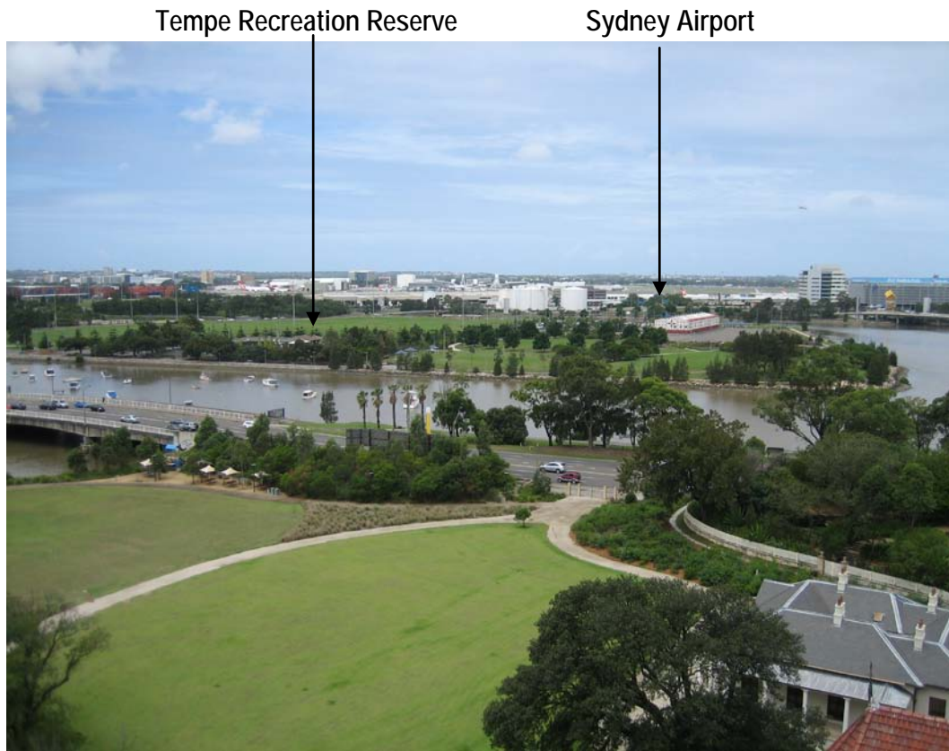
Figure 11: View to the east with Discovery Point Park in the foreground