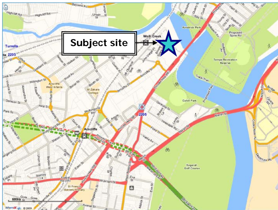
Figure 1 – Location Plan