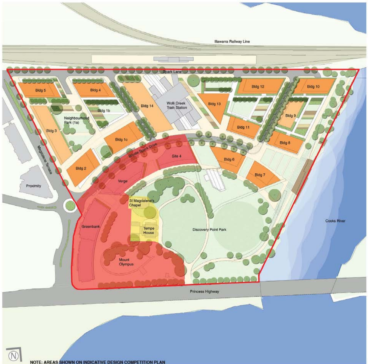
Figure 7 – Land subject to and excluded from the Part 3A application