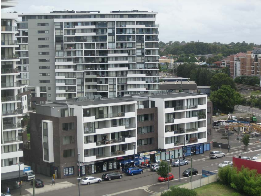
Figure 9: Part of 'Proximity' development along Magdalene Terrace

Also adjoining Discovery Point to the south at 78-96 Arncliffe Street, Wolli Creek (refer to Figures 8 and 10 ) is a vacant disused industrial site which is currently subject to a Part 3A Concept Plan application for a mixed use development. The Planning Report submitted to the Department of Planning for this mixed use development known as the 'NAHAS Construction site' indicates that the proposed development includes approximately 25,000m 2 of retail space and 45,000m 2 of gross floor area for residential and serviced apartments. The report states that the residential component will include three towers ranging in height from 8 to 22 storeys.