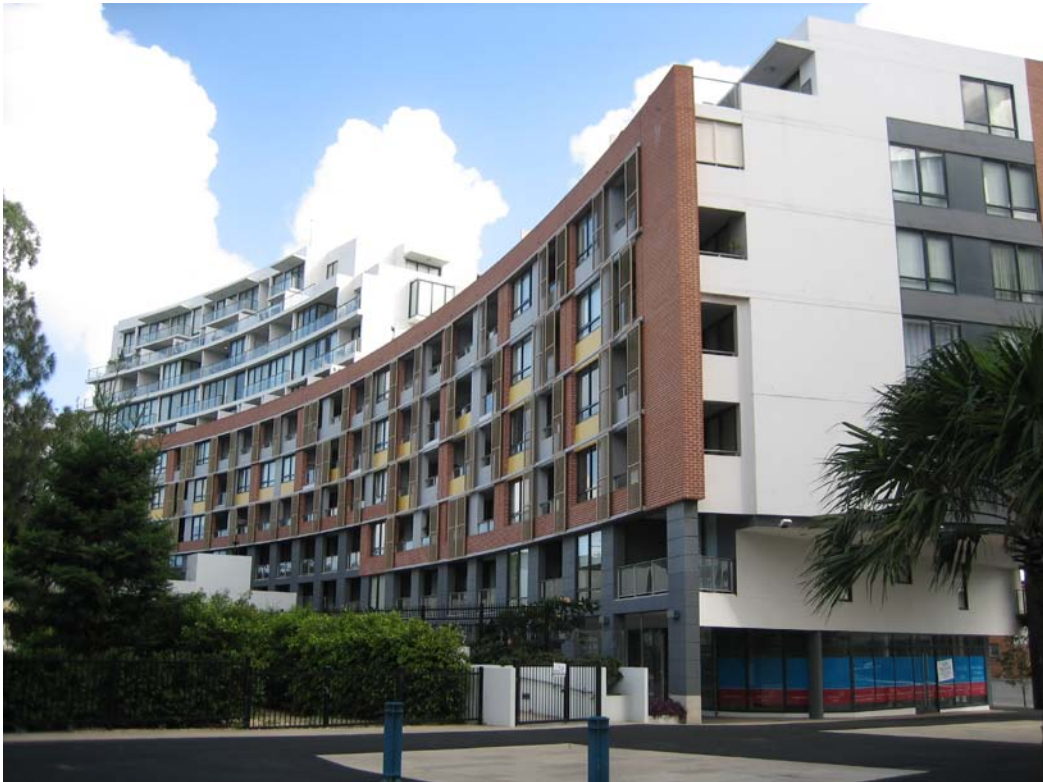
Figure 4: Existing Discovery Point Site 1 building 'Greenbank'