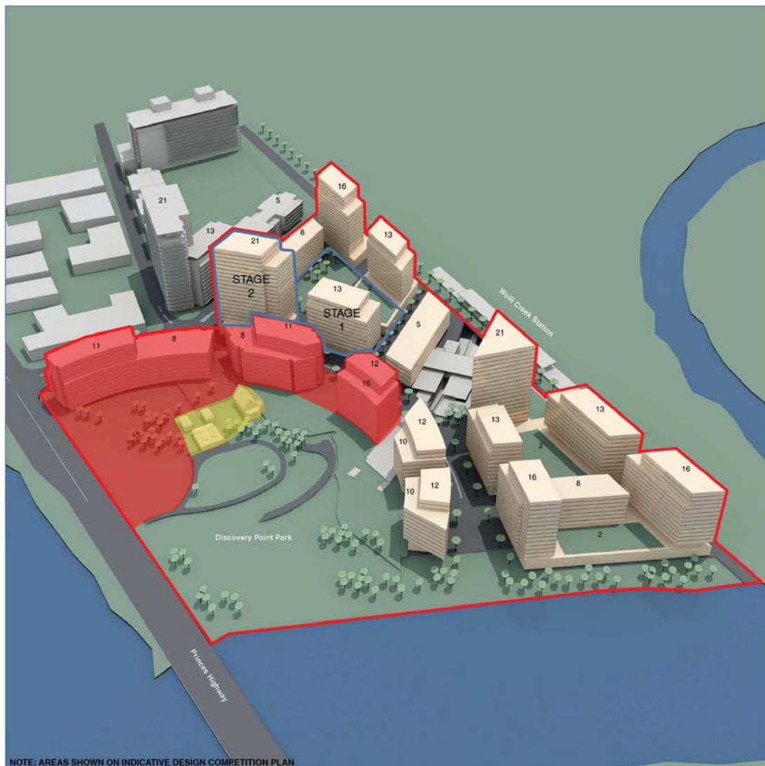
Figure 13: Design Competition Scheme showing indicative proposed building heights