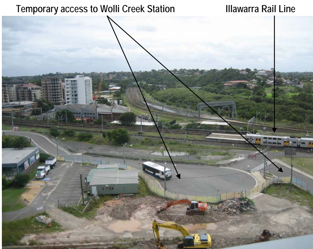
Figure 6: Southern part of Discovery Point Site still to be developed