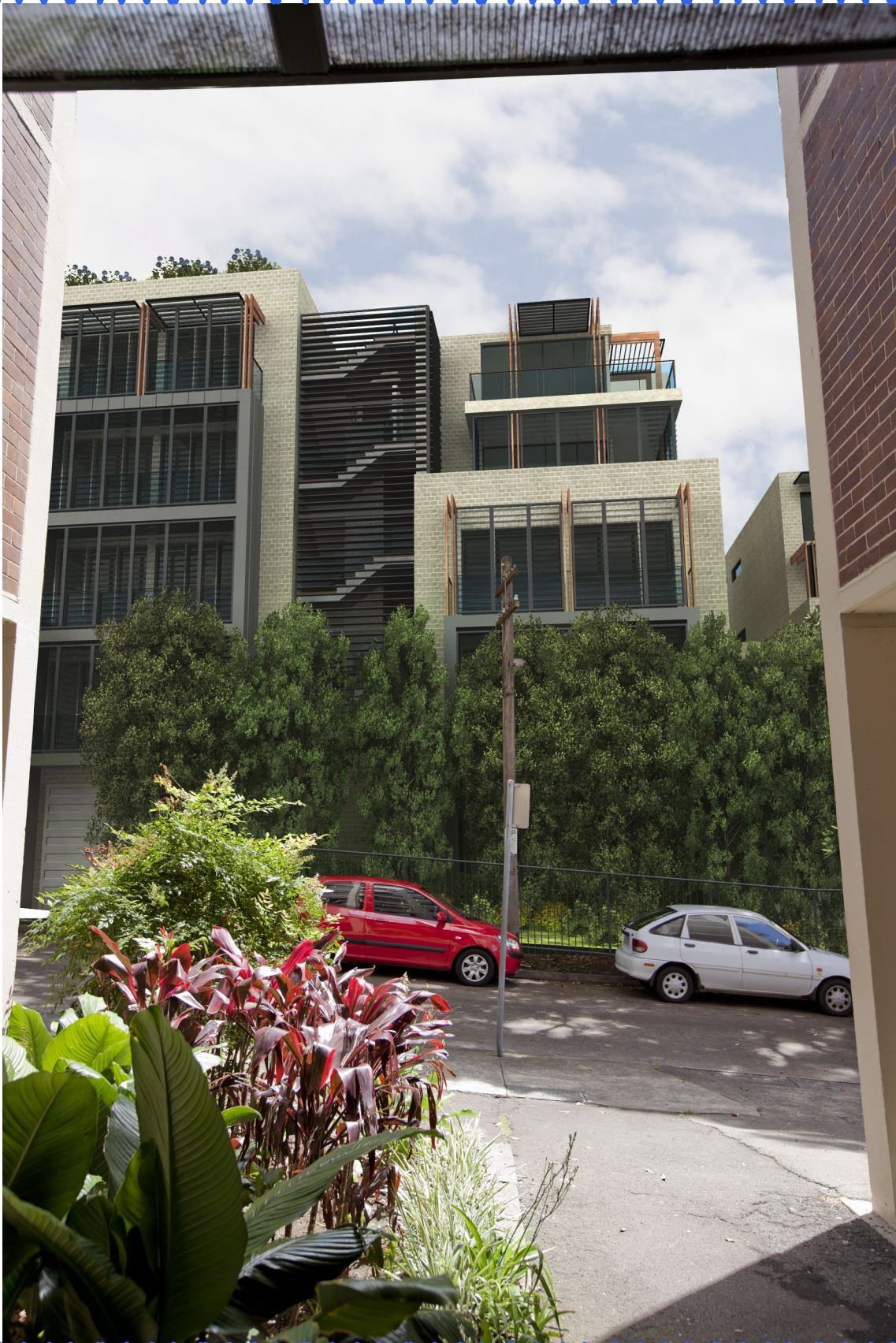
Proposed View 4 - Stephen St