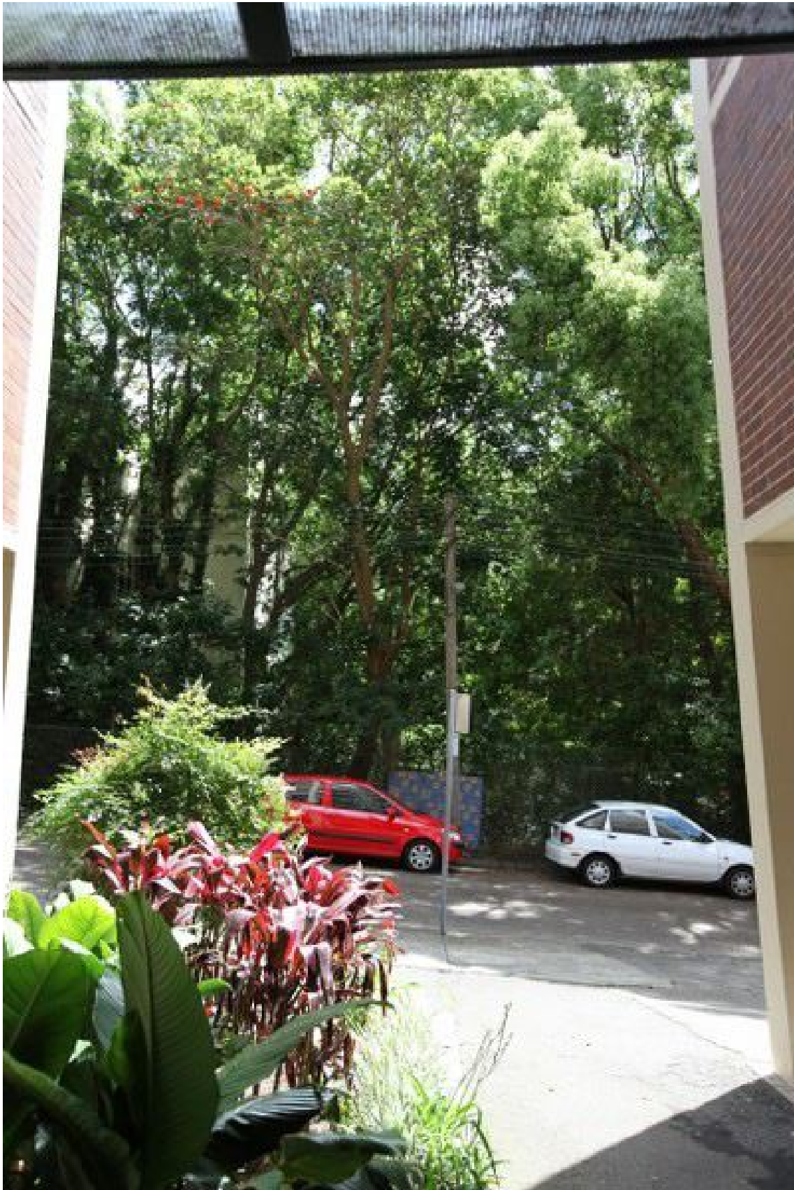
Existing View 4 - Stephen St