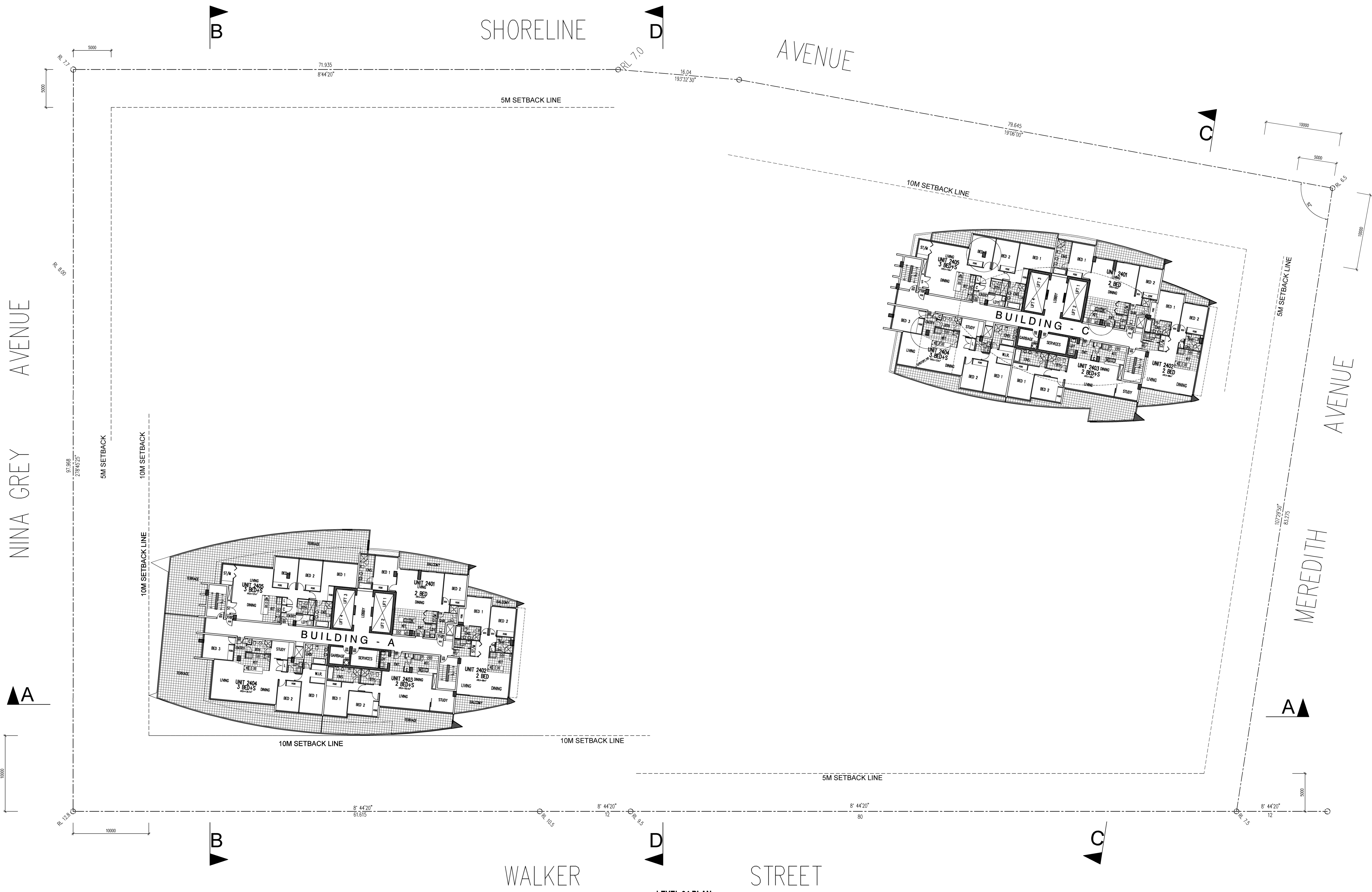
LEVEL 24 PLAN SCALE 1:200