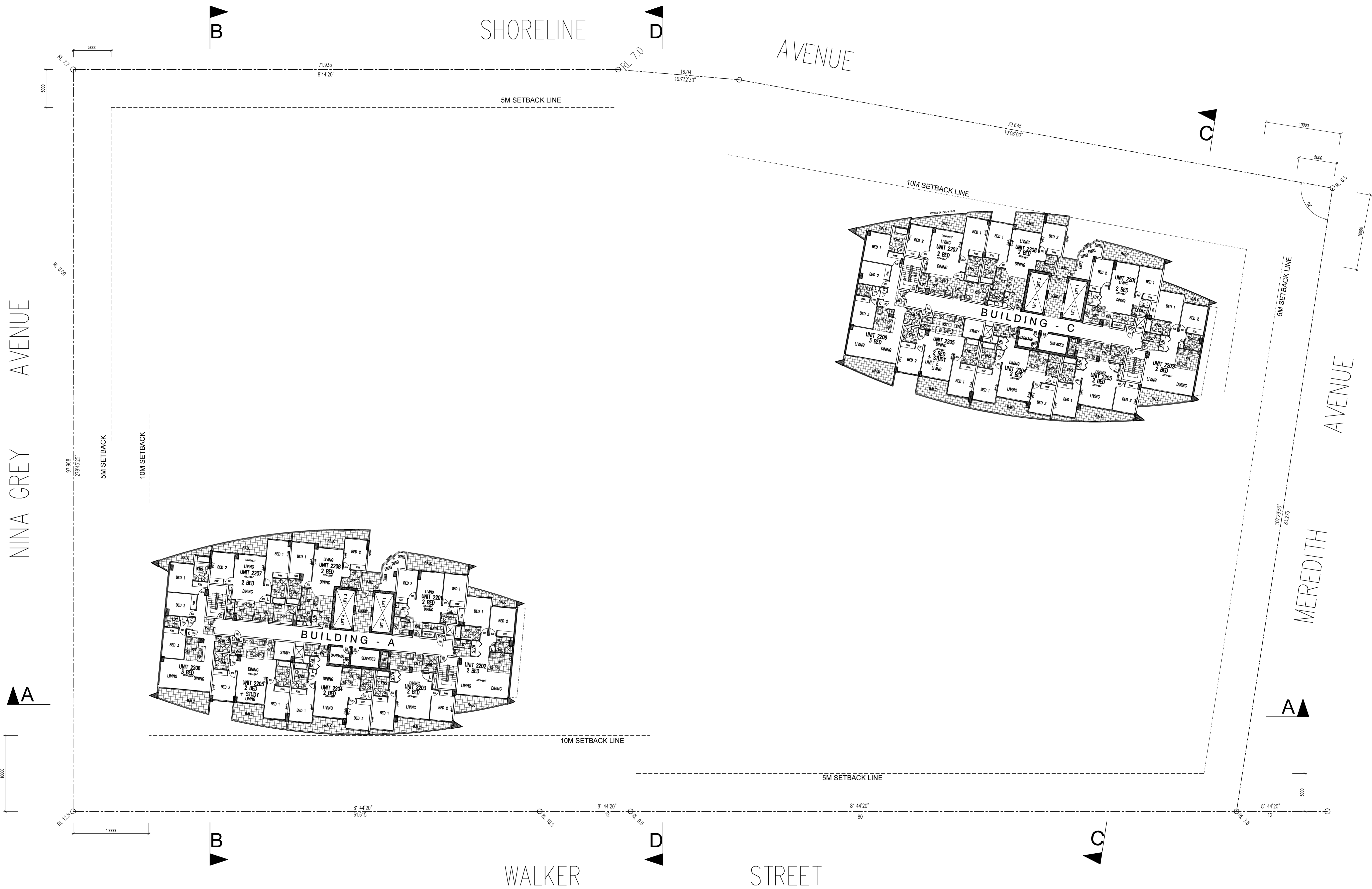
LEVEL 22 PLAN SCALE 1:200