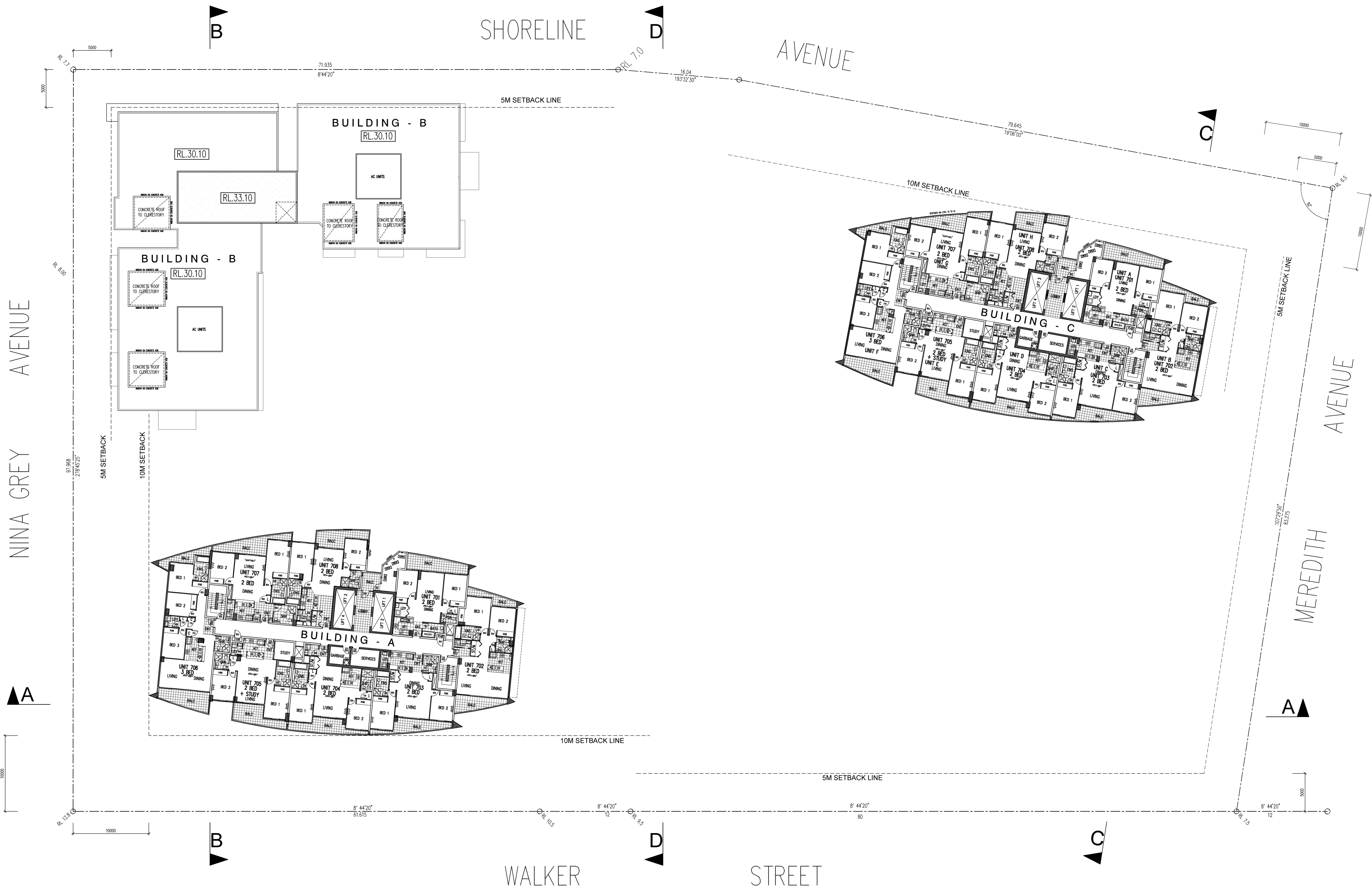
LEVEL 7 PLAN SCALE 1:200