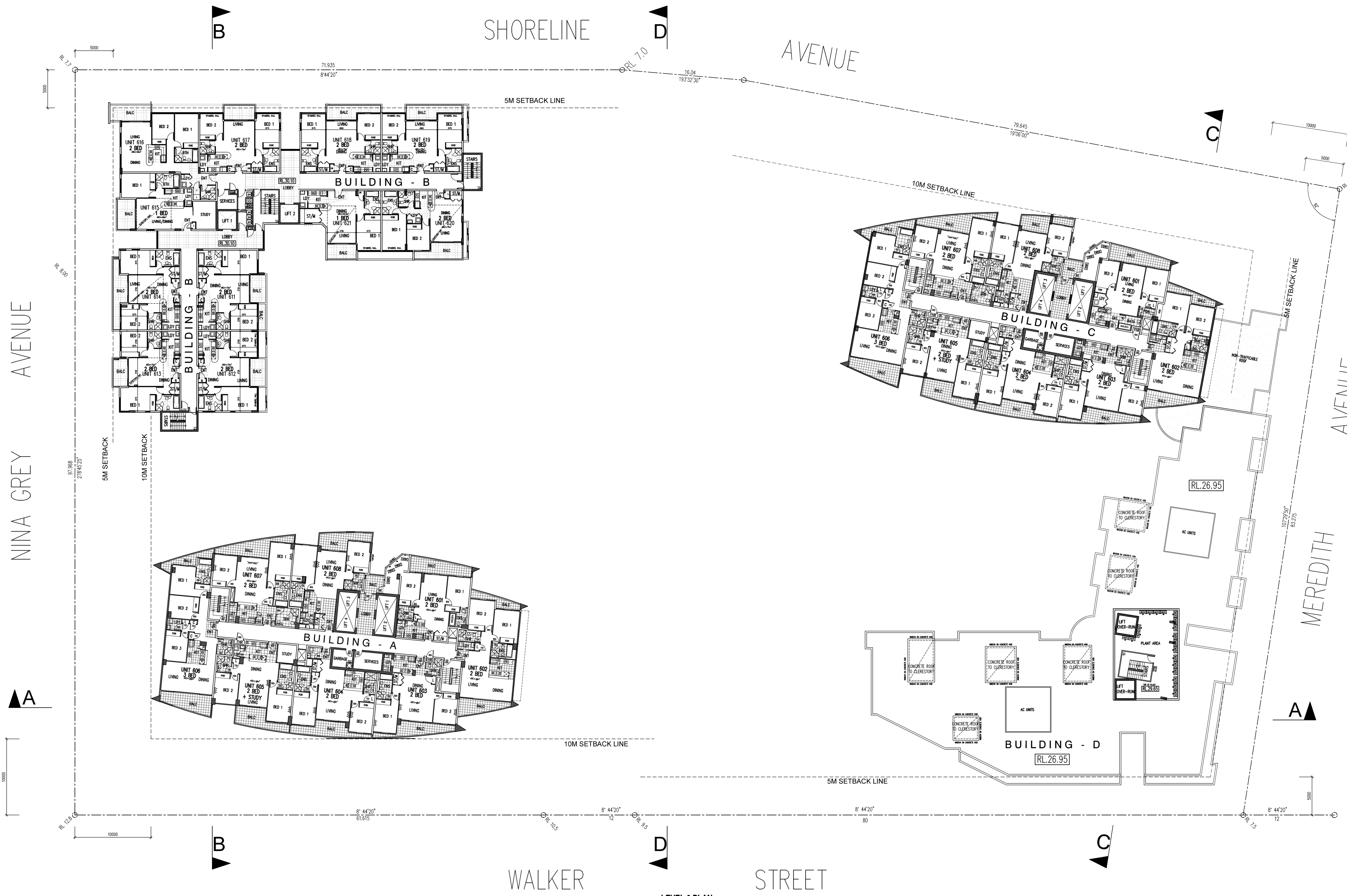
LEVEL 6 PLAN SCALE 1:200