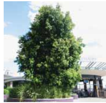
Waterhousia floribunda - Weeping Lillypilly