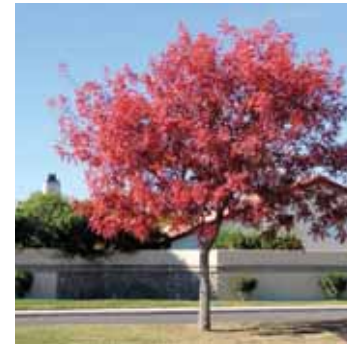
Pistacia chinensis - Pistachio