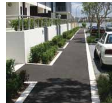
Rhodes streetcape Bitumen with edging