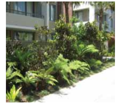
Mixed Shrub & Groundcover Planting