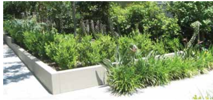
Mixed Shrub and groundcover planting beds