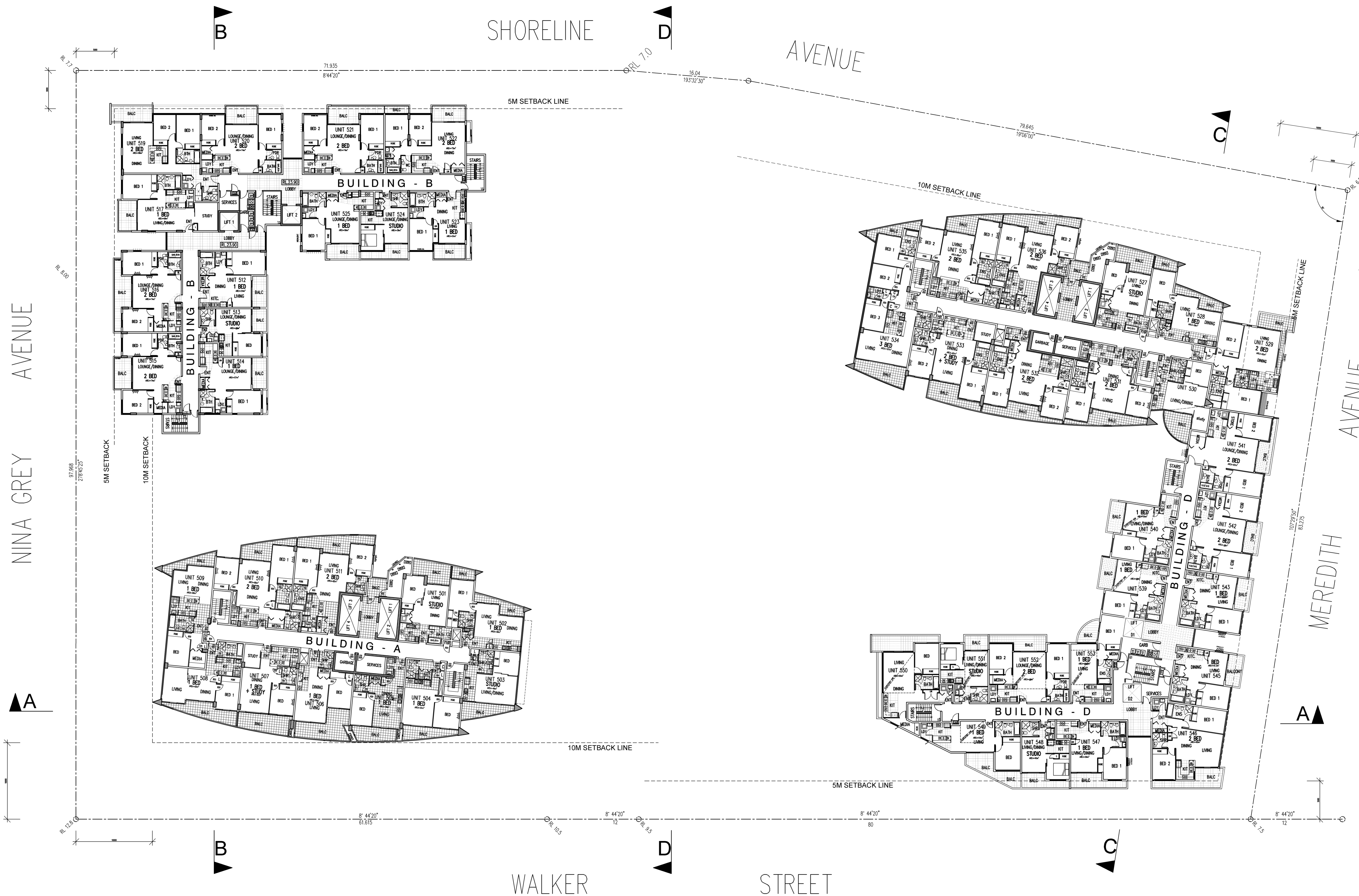
LEVEL 5 PLAN SCALE 1:200