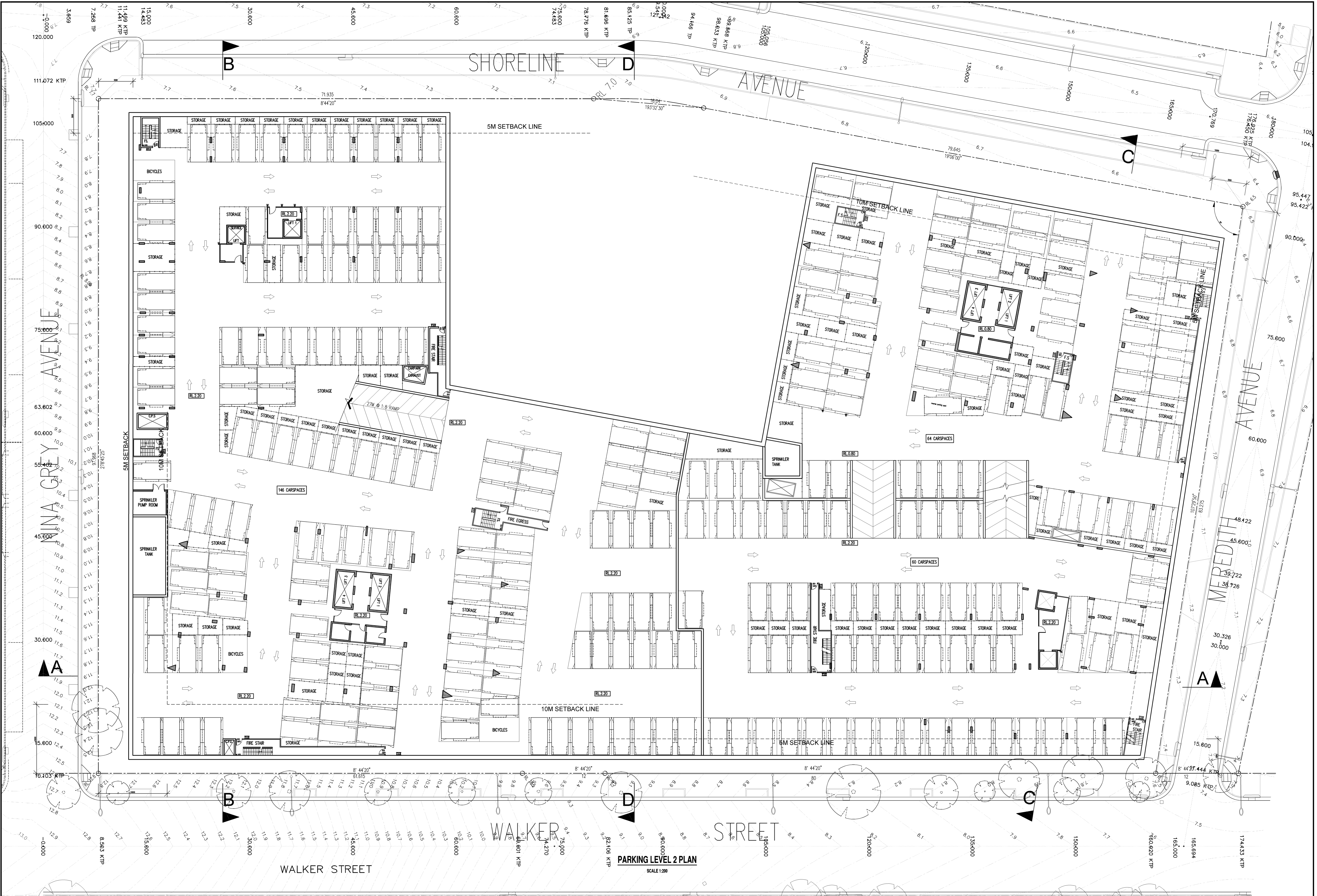
PARKING LEVEL 2 PLAN SCALE 1:200