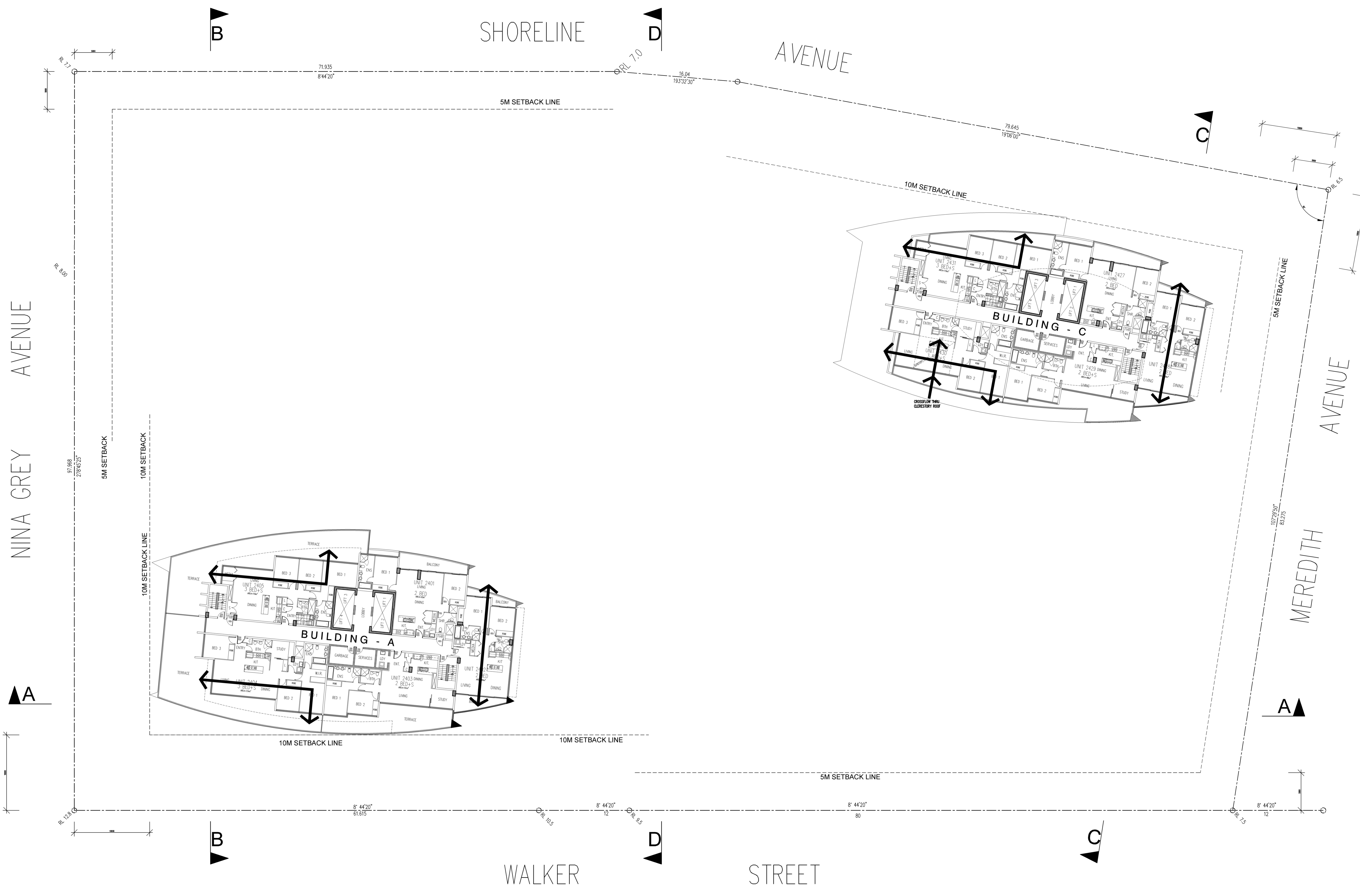
CROSS VENTILATION LEVEL 24 PLAN SCALE 1:200