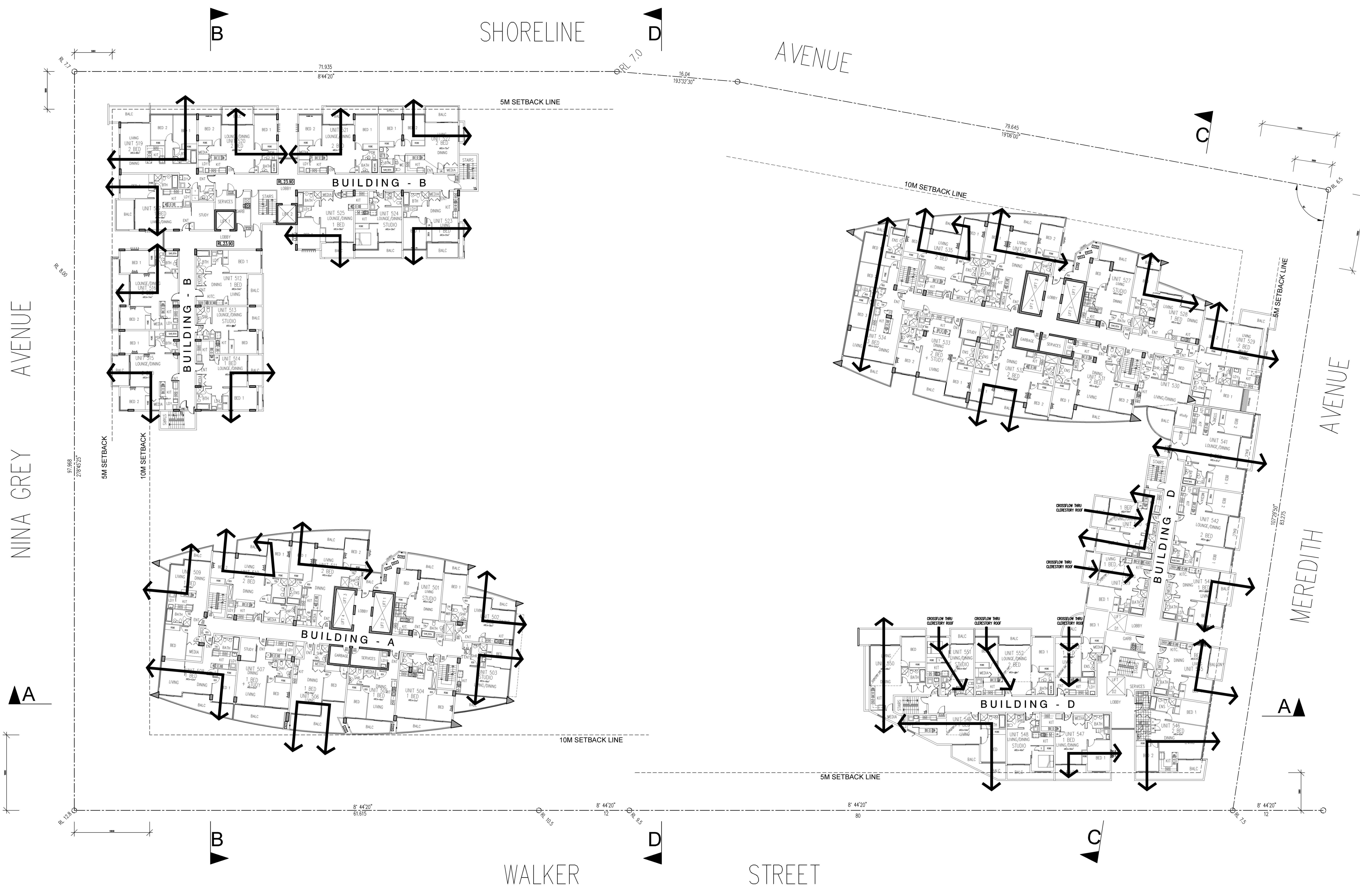
CROSS VENTILATION LEVEL 5 PLAN SCALE 1:200