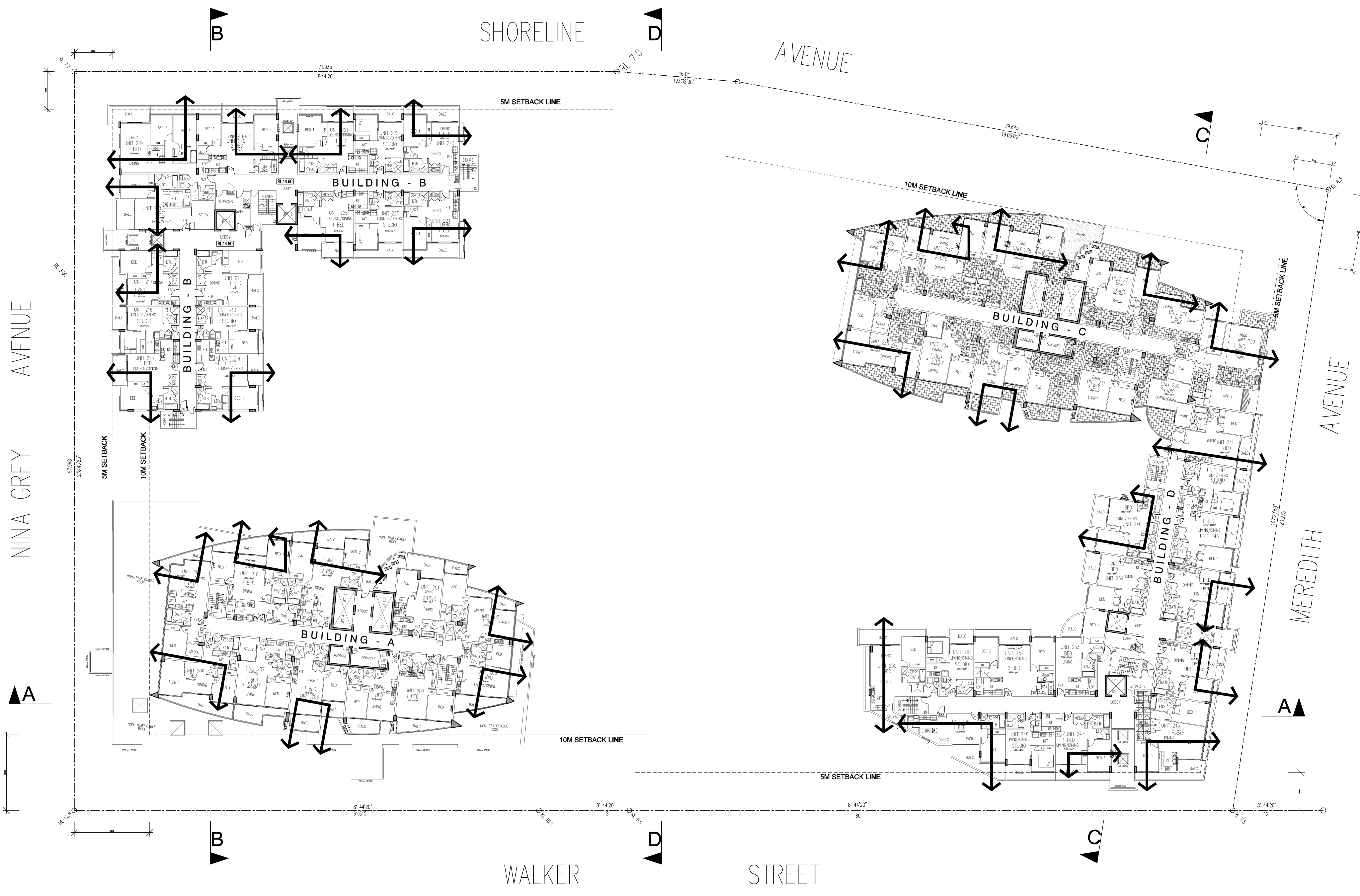
CROSS VENTILATION LEVEL 2 PLAN SCALE 1:200