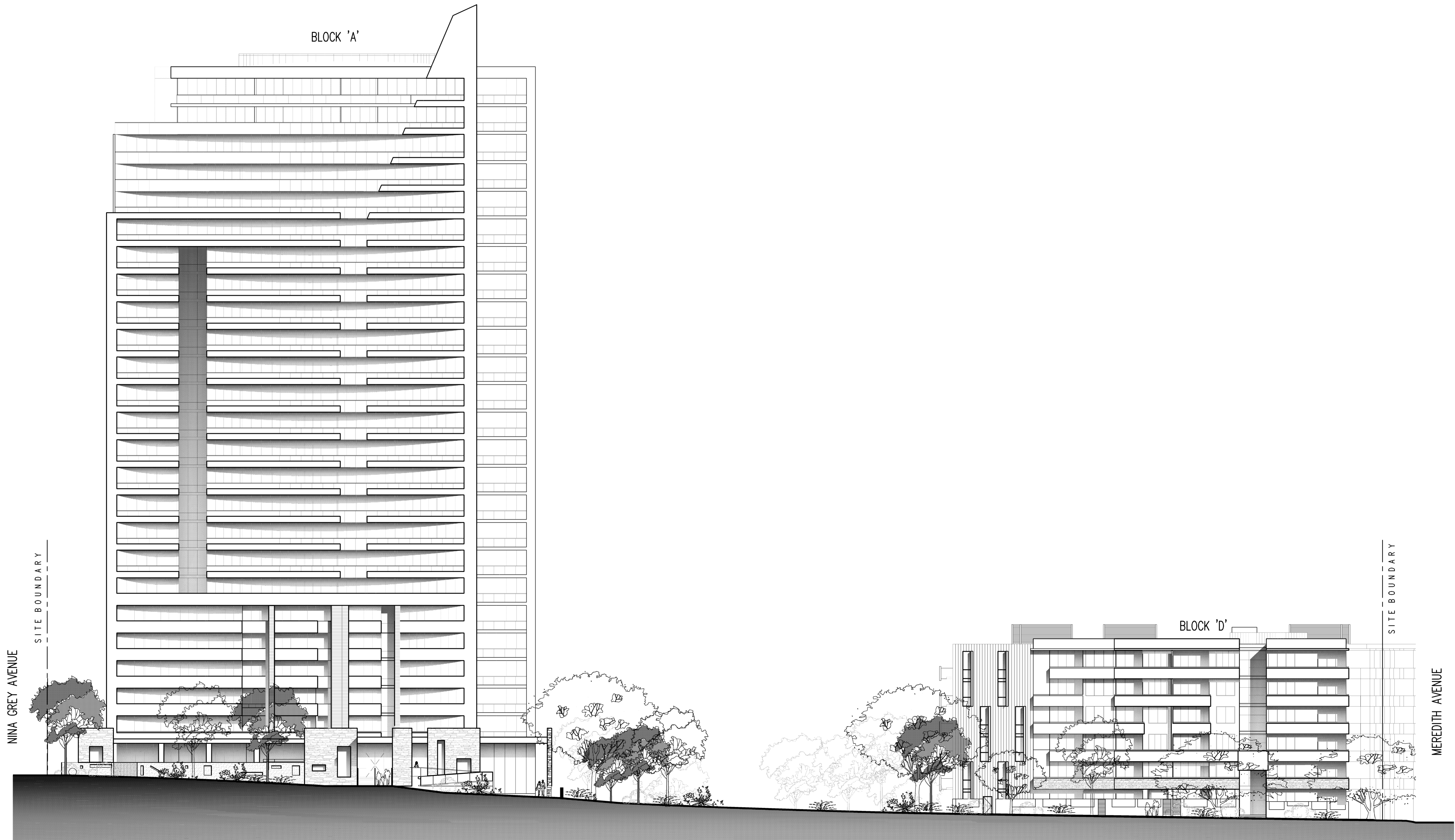
WALKER ST ELEVATION SCALE 1:200