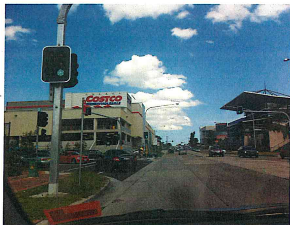
Figure 3 View east along Parramatta Rd