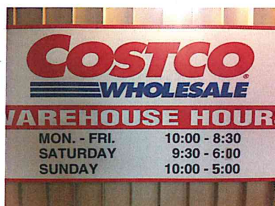
Figure 2 Existing trading hours

The department visited the site on 15 December 2011.