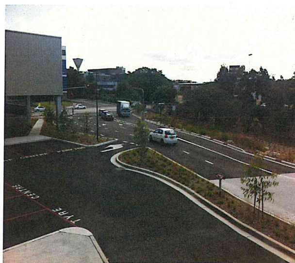
Figure 4 Entry/exit onto Parramatta Rd