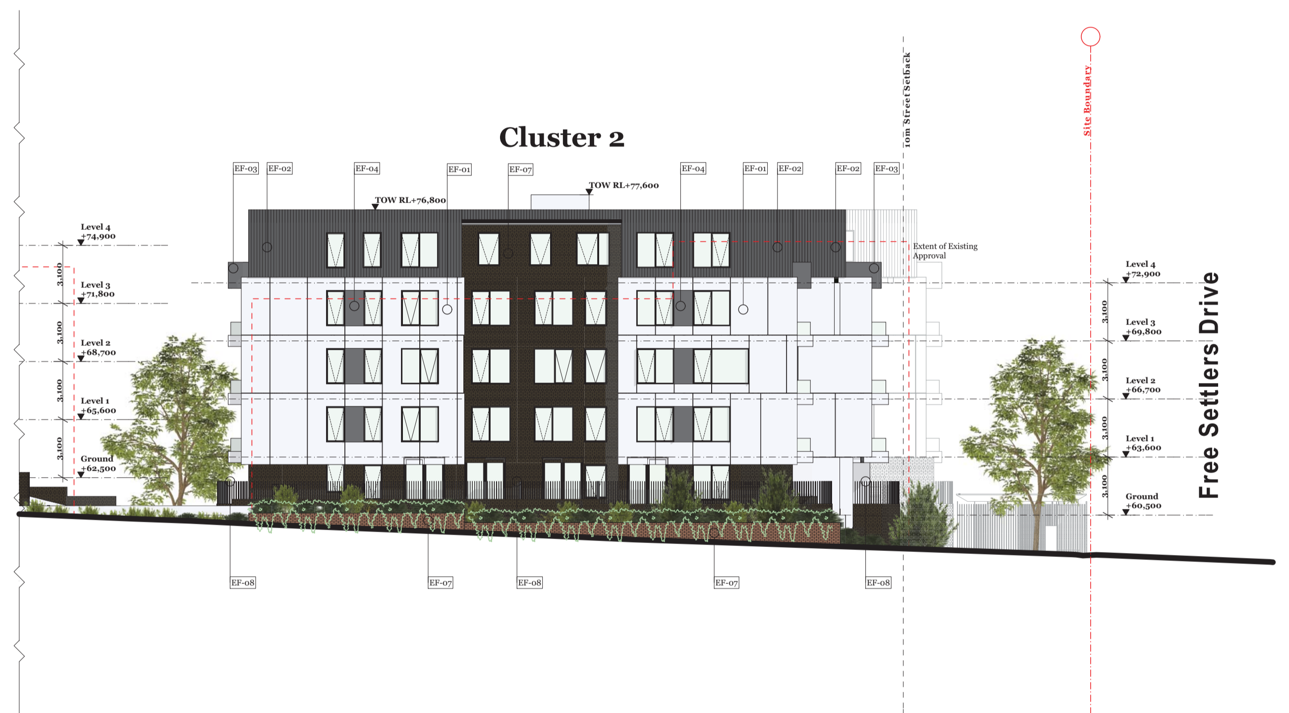
2 CL2 North-West Elevation 1:200