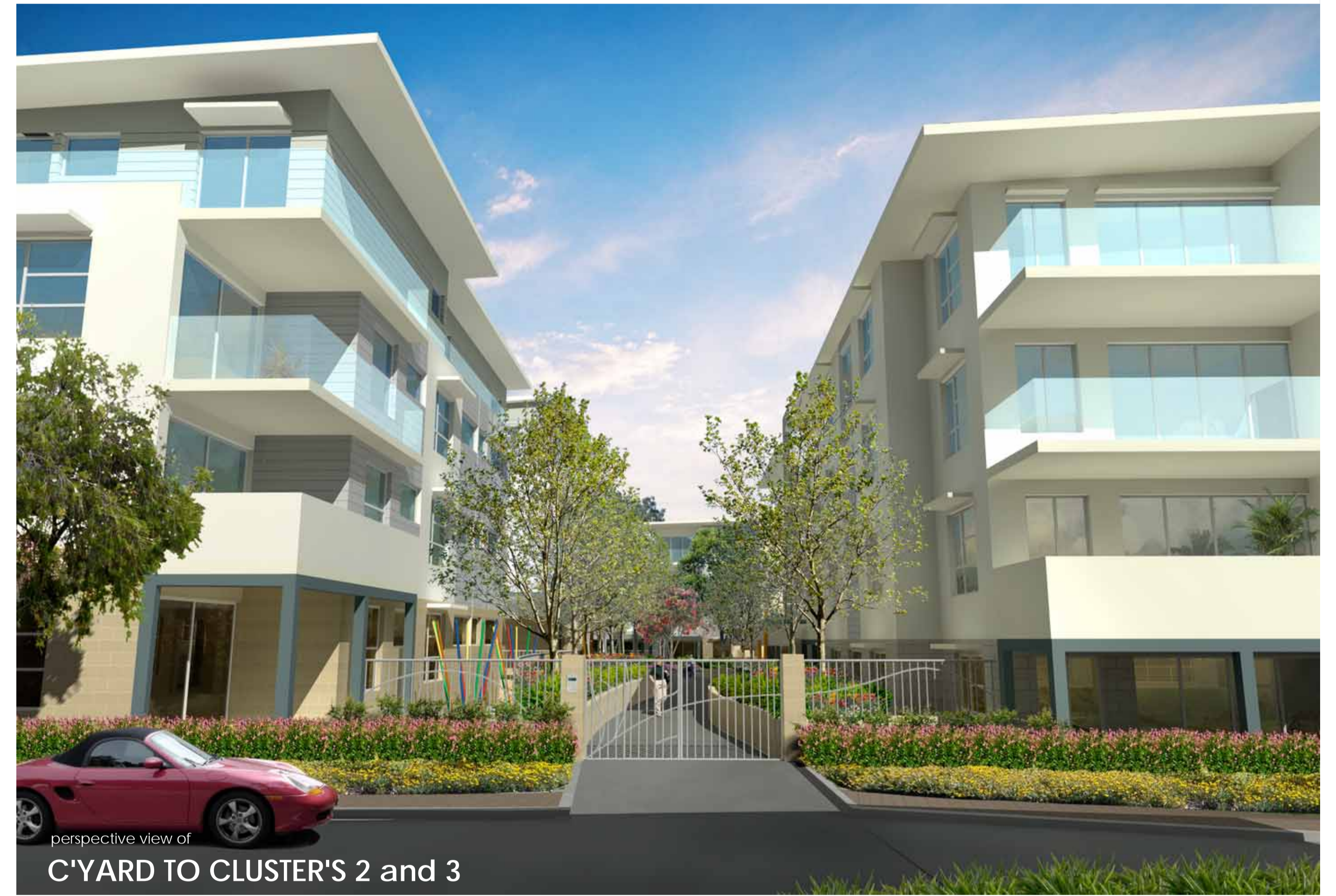
perspective view of C'YARD TO CLUSTER'S 2 and 3