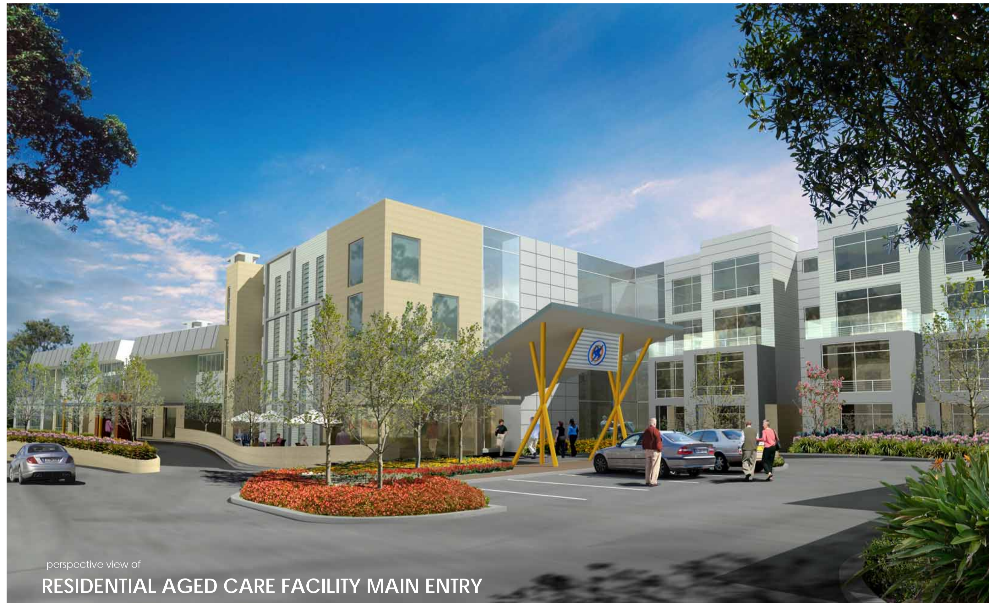
perspective view of RESIDENTIAL AGED CARE FACILITY MAIN ENTRY