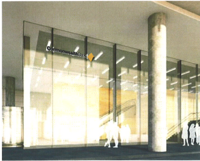
PROPOSED MONTAGE (Not to Scale)