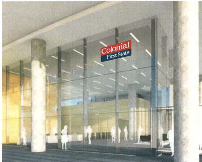
PROPOSED MONTAGE (Not to Scale)

FABRICATED ALUMINIUM SIGN BOX OPAL ACRYLIC FACE WITH COMPUTER CUT GRAPHICS SUBJECT TO GLAZING MULLION DETAIL