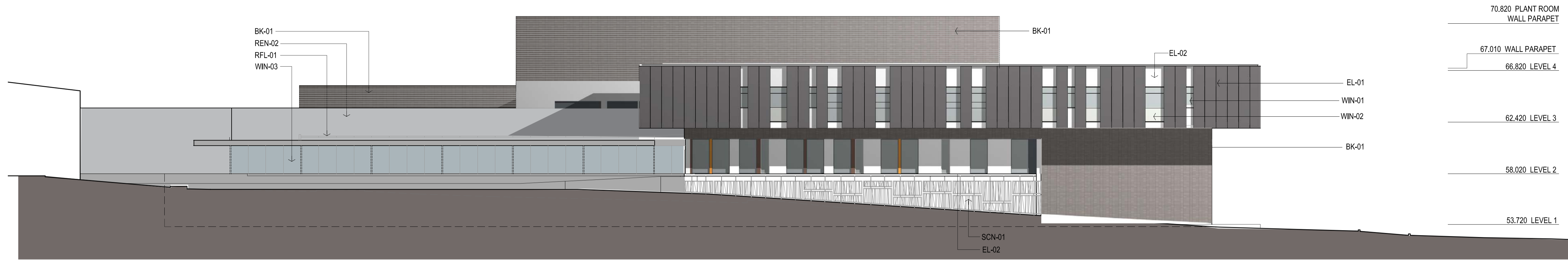
01 SOUTH ELEVATION EB 1:200