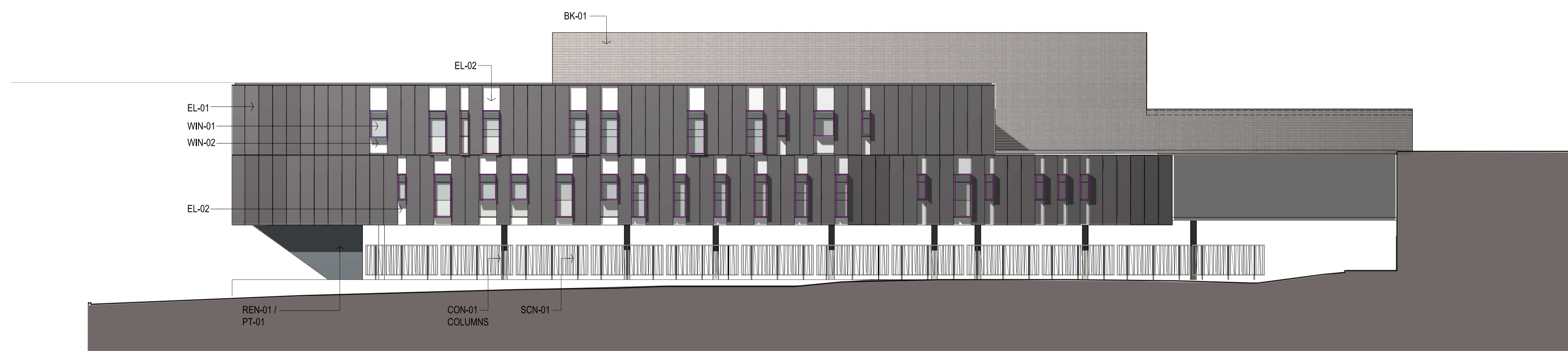
03 NORTH ELEVATION EB 1:200