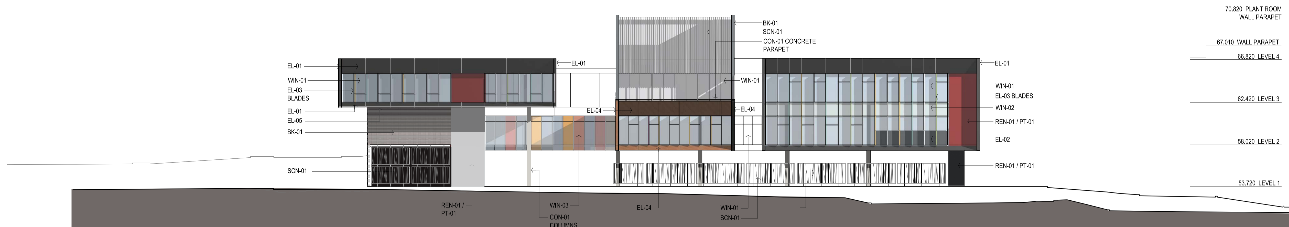
02 EAST ELEVATION EB 1:200