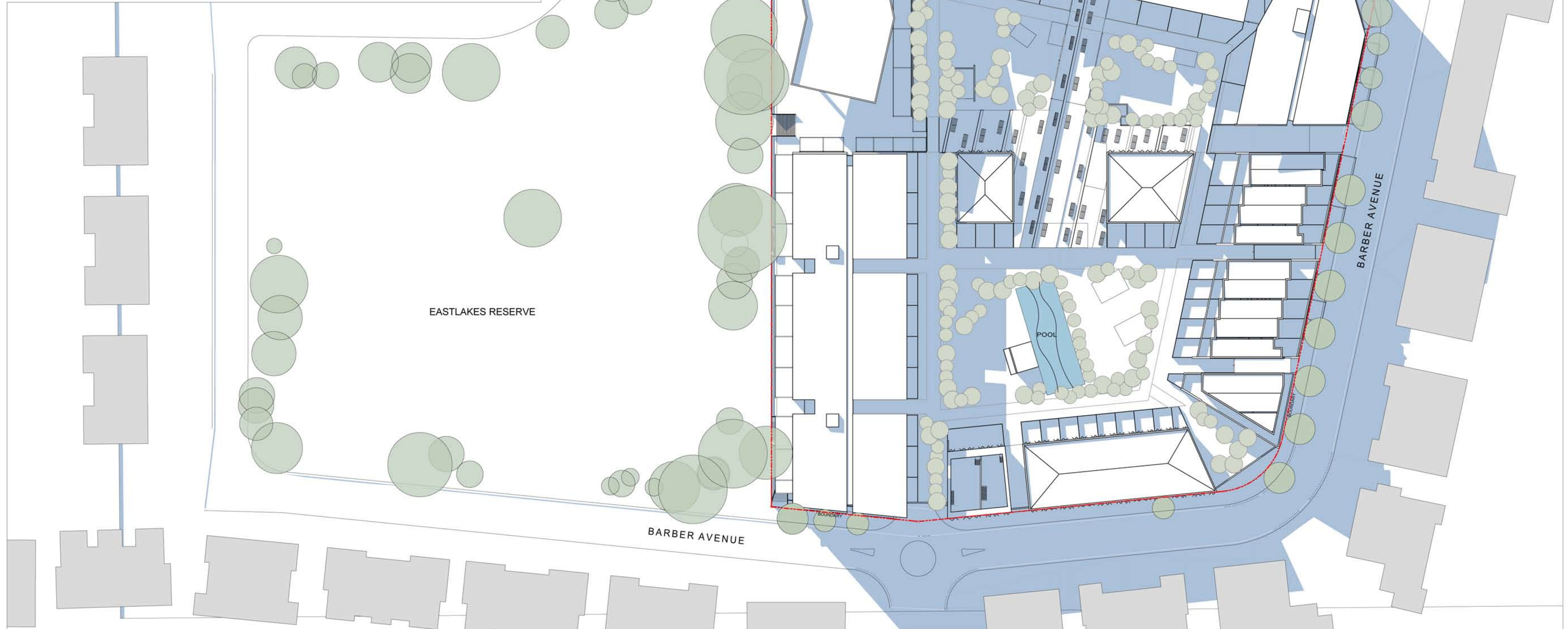
1 ISOMETRIC JUNE 21 (EQUINOX) 3PM