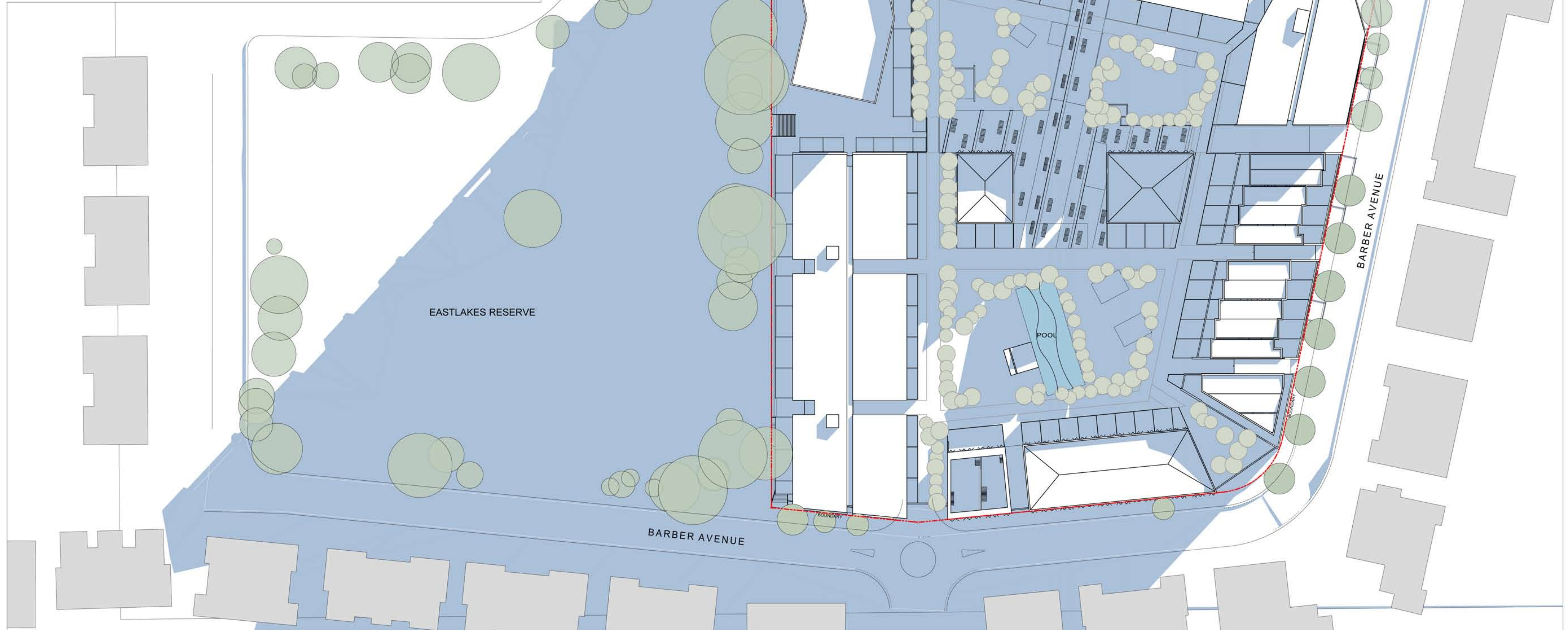
1 ISOMETRIC JUNE 21 (EQUINOX) 9AM