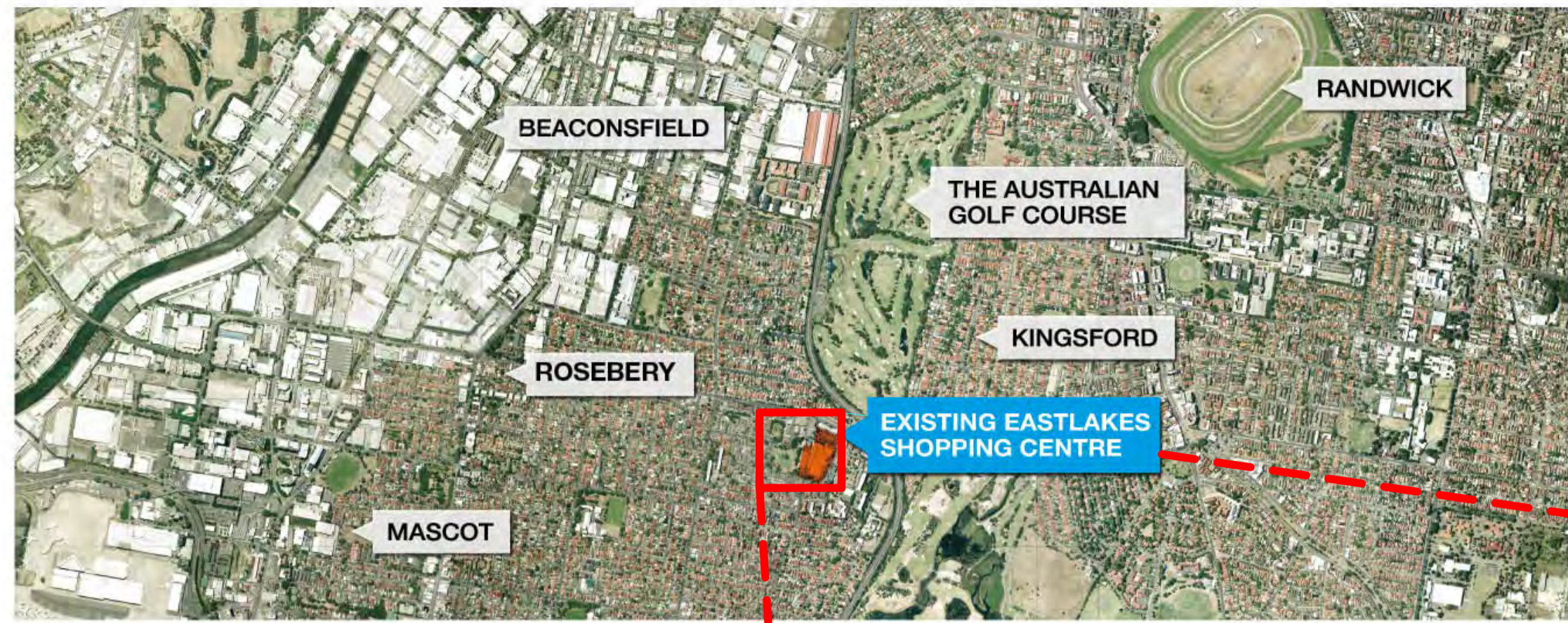
1 PLAN LOCALITY PLAN N.T.S