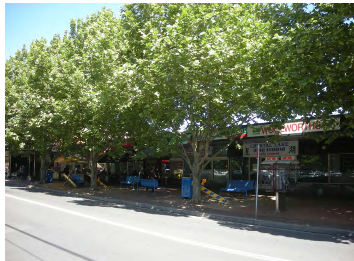
1. FROM EVANS AVENUE