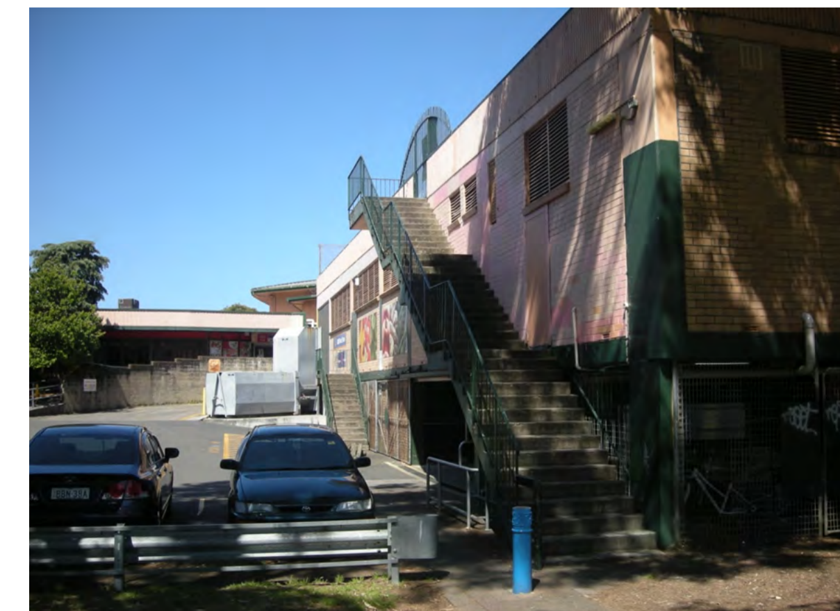
4. FROM BARBER AVE TOWARDS EXISTING STRUCTURE