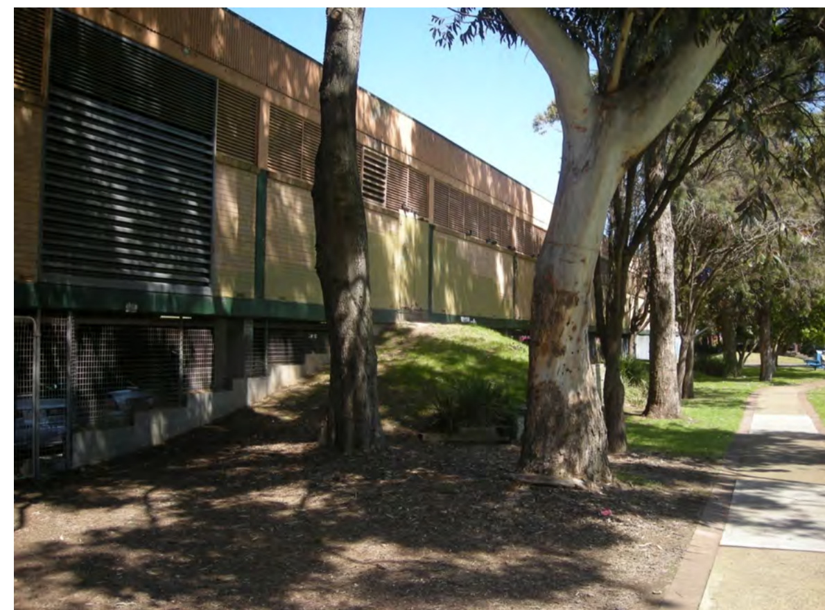
2. FROM PARK TOWARDS EXISTING STRUCTURE