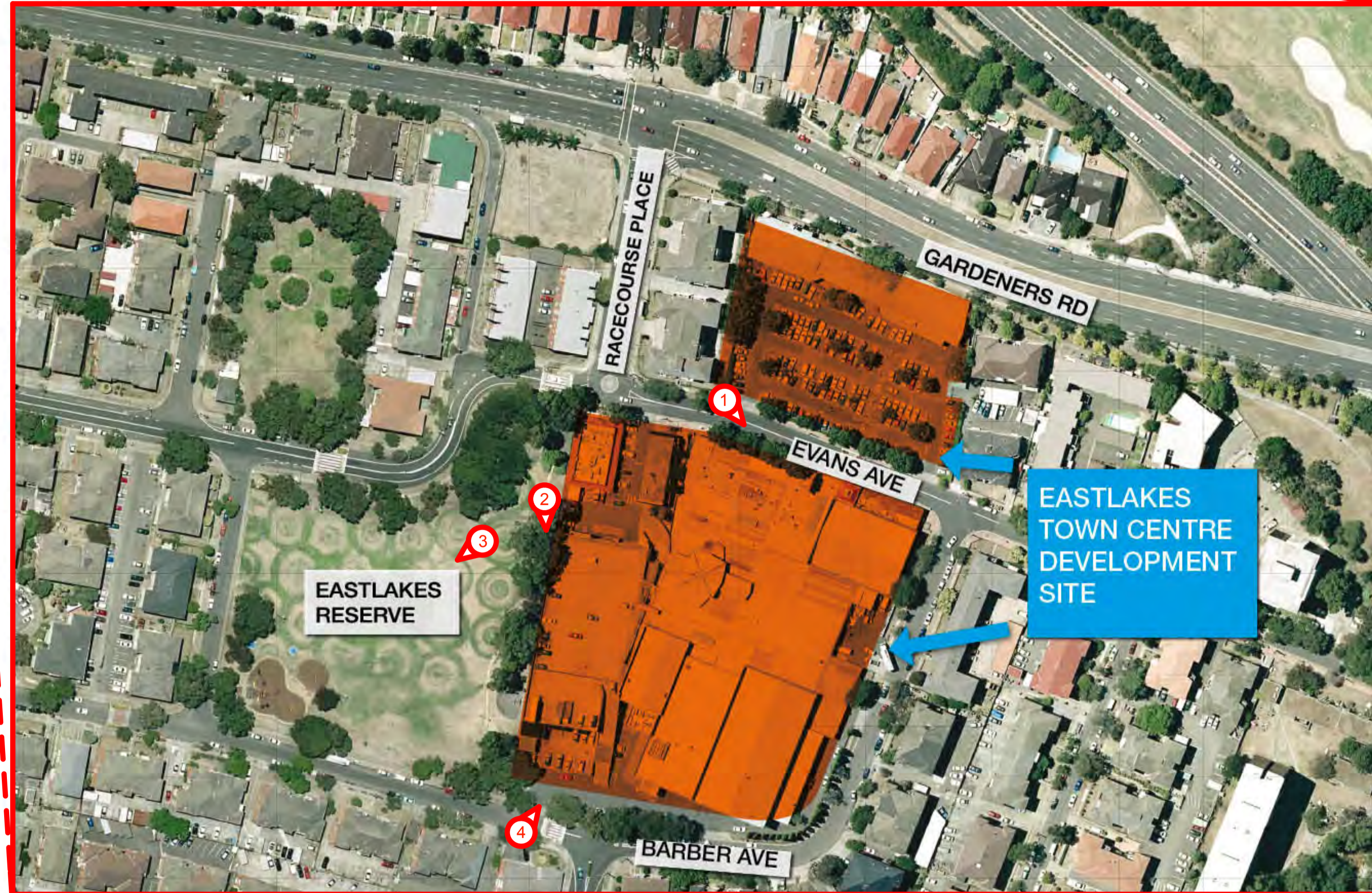
2 PLAN SITE CONTEXT PLAN N.T.S