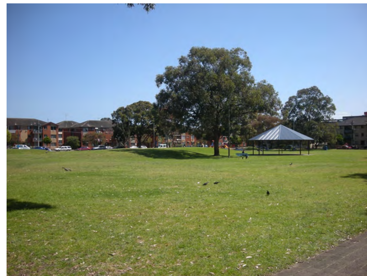
3. EXISTING EASTLAKES RESERVE