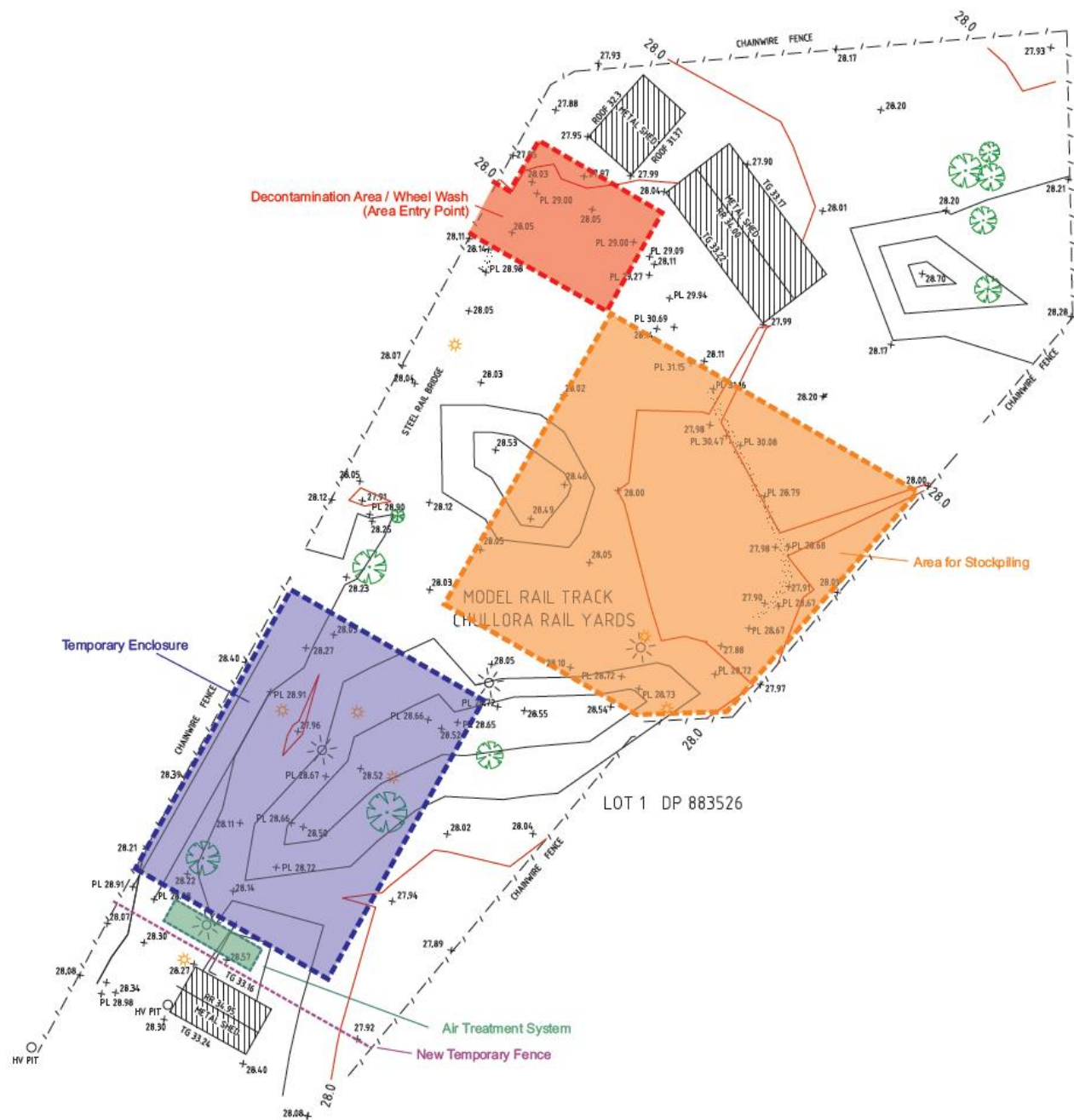
Figure 2: Chullora Site Layout