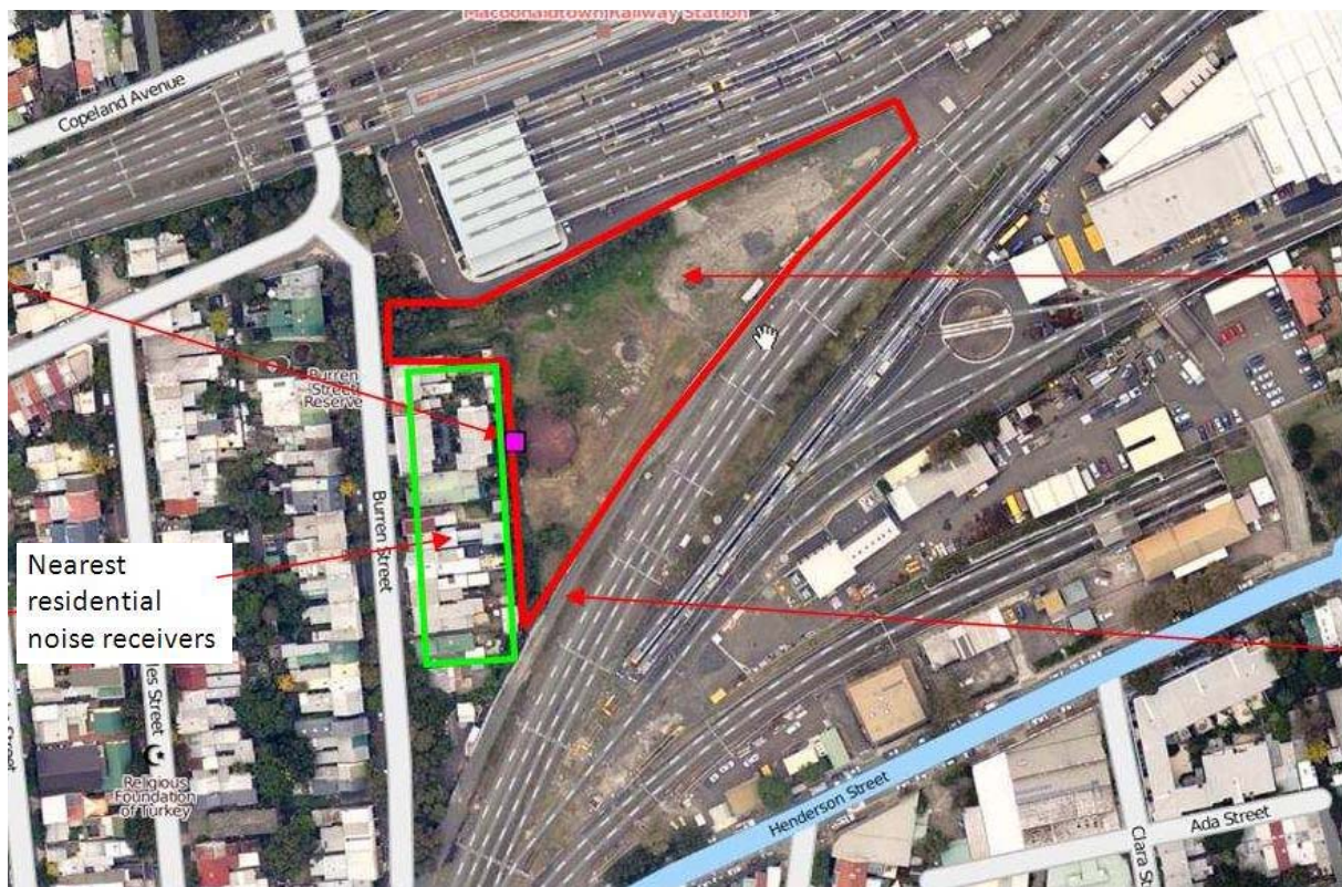
Figure 1: Noise Receiver Locations – Burren Street, Macdonaldtown