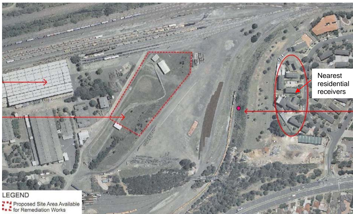
Figure 2: Noise Receiver Locations – Marlene Crescent, Chullora