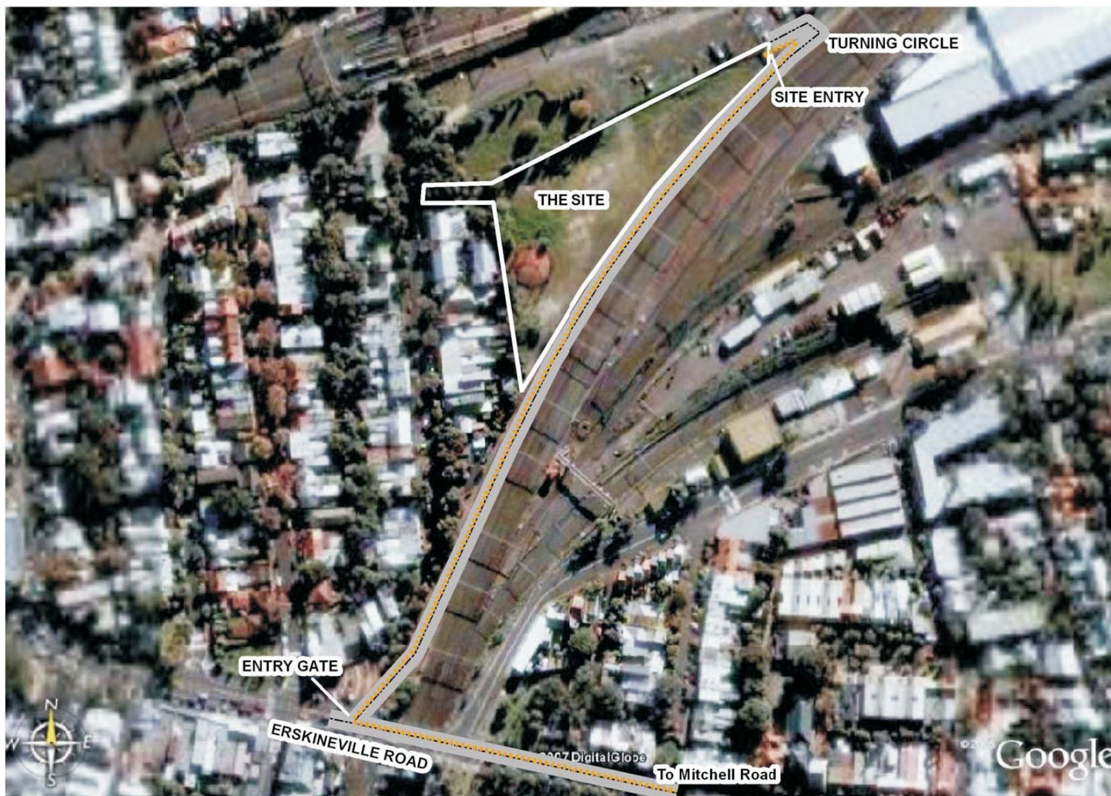
Figure 2 Current Macdonaldtown Site Plan

CH2M Hill (2007) Note- All locations shown are approximate only