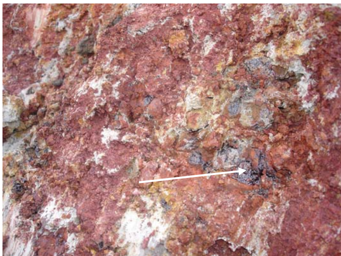
Photo 61 (Aug 06) – Tar within soil pores in natural clay, from testpit MG08 beneath former retort house