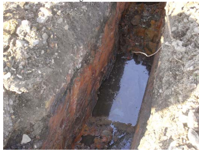
Photo 64 (Aug 06) – Fill profile in testpit MG11, near location of former purifiers