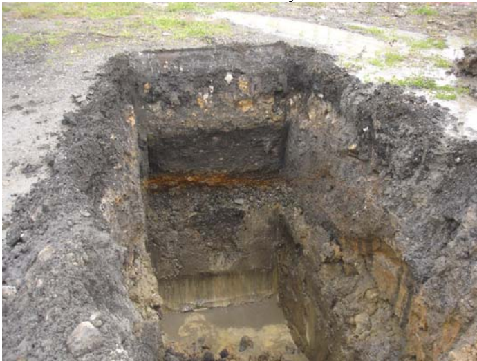
Photo 69 (Aug 06) – Fill profile in testpit TP06, in eastern site area