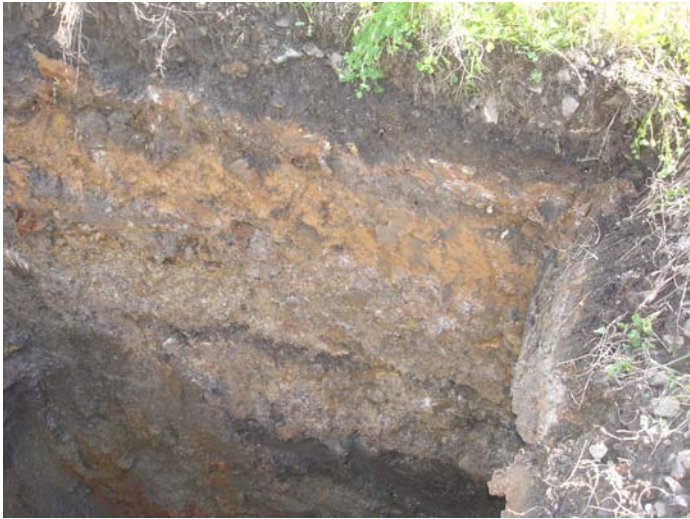
Photo 67 (Aug 06) – Fill profile in testpit TP03, along southern site boundary