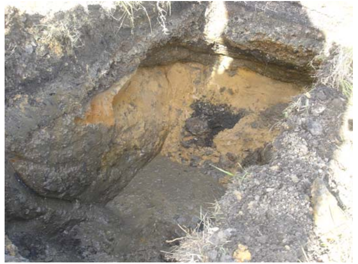
Photo 68 (Aug 06) – Fill profile in testpit TP05, along southern site boundary