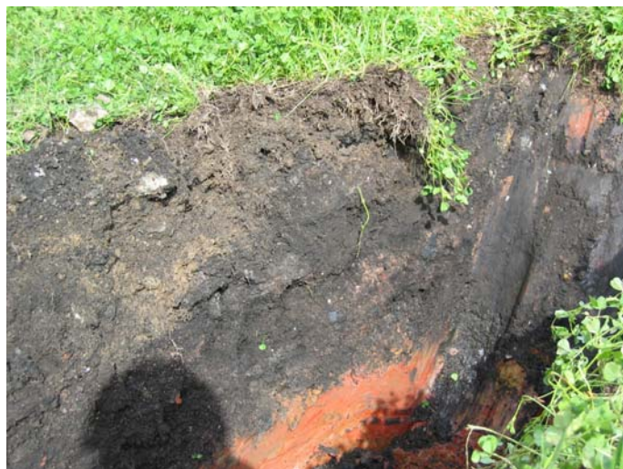
Photo 62 (Aug 06) – Fill profile in testpit MG10, beneath eastern edge of former retort house