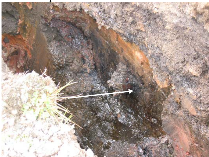
Photo 63 (Aug 06) – Tarry materials and a buried brick structure within testpit MG10, beneath eastern edge of former retort house