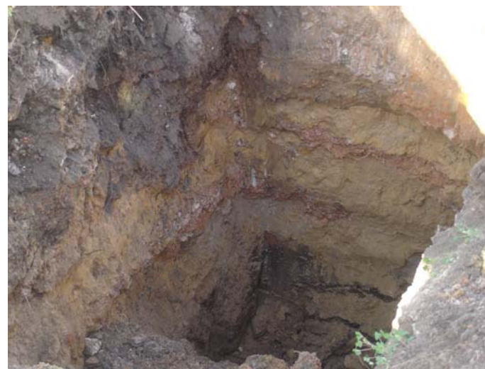
Photo 66 (Aug 06) – Fill profile in testpit TP01, in south western corner of site