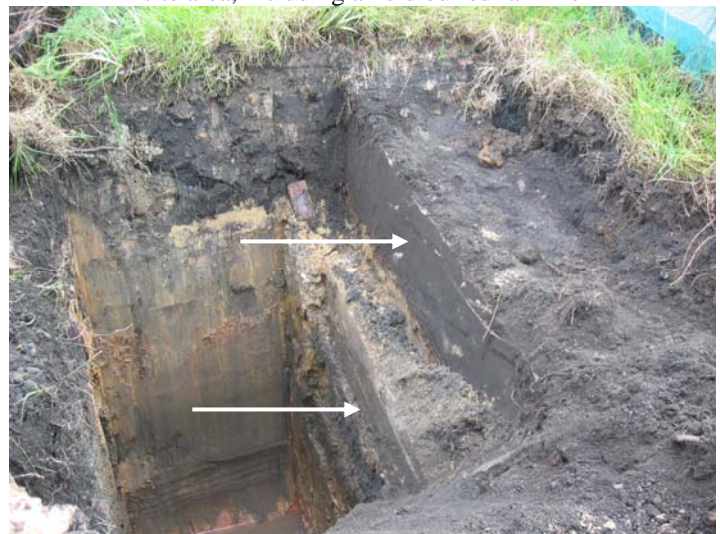
Photo 72 (Aug 06) – Fill profile in testpit TP10, on northern site boundary, including two stepped retaining wall