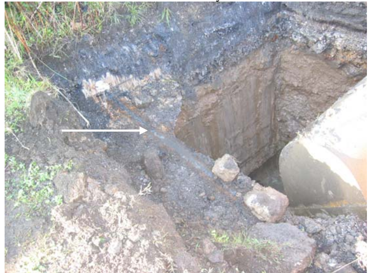
Photo 70 (Aug 06) – Fill profile in testpit TP07, in south eastern site area, including an old buried rail line