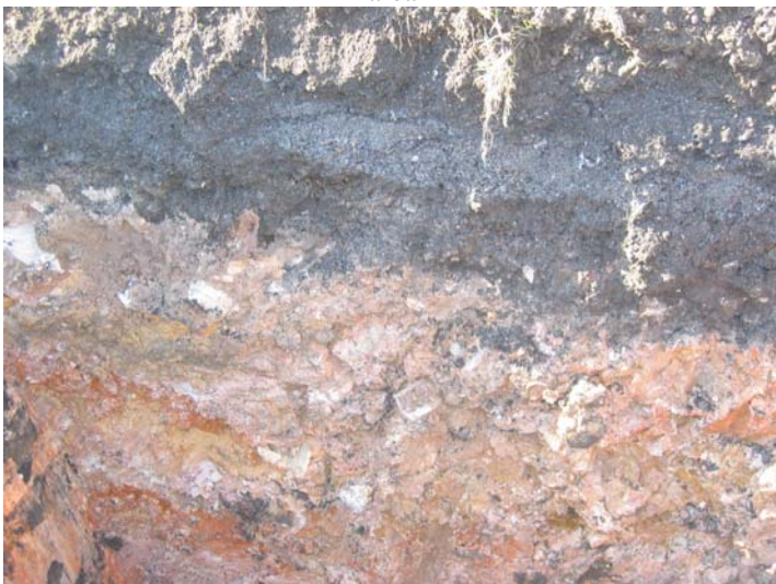
Photo 71 (Aug 06) – Fill profile in testpit TP08, in eastern site area