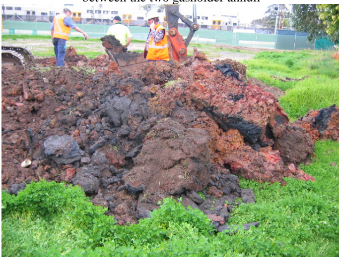
Photo 41 (Aug 06) – Material excavated from area adjacent to northern gasholder annulus