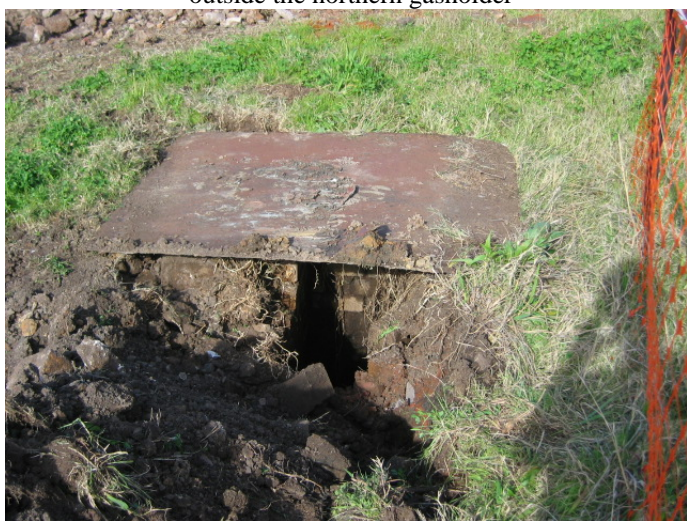
Photo 47 (Aug 06) – Pit located immediately to the south of the existing gasholder