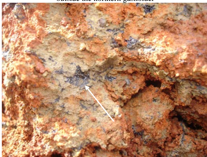
Photo 46 (Aug 06) – Tar within soils pores in natural clay (exact location not documented)