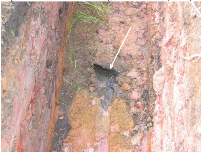
Photo 39 (Aug 06) – Tar pipe and fill layers in testpit MG02, between the two gasholder annuli