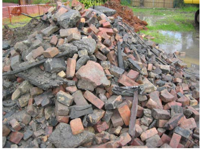
Photo 38 (Aug 06) – Waste materials within testpit MG04, inside northern gasholder annuli