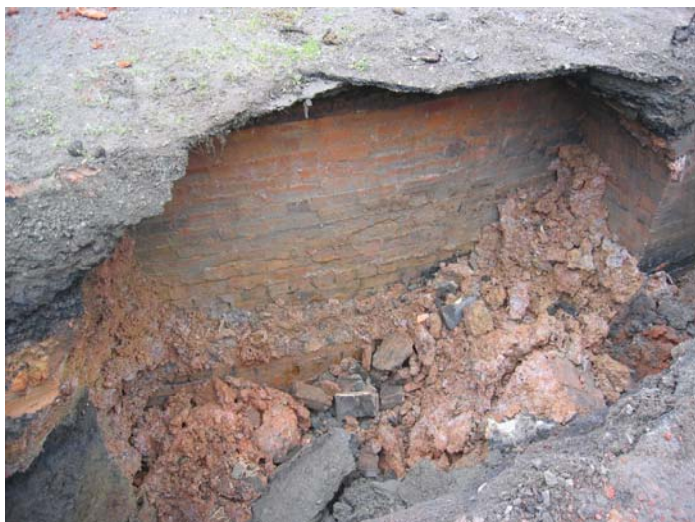
Photo 43 (Aug 06) – The outside of the northern gasholder annulus, exposed in testpit MG05