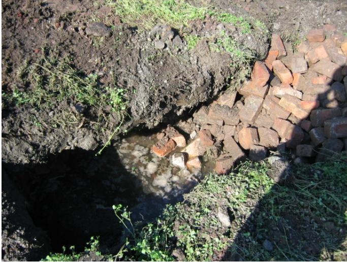
Photo 37 (Aug 06) – Demolition materials and significant perched water within northern gasholder annulus (MG04)