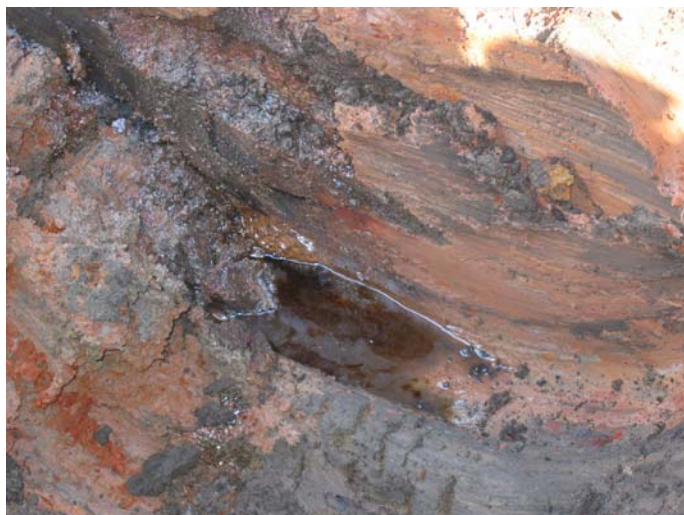
Photo 44 (Aug 06) – Tar and oil seeping into testpit MG05, outside the northern gasholder