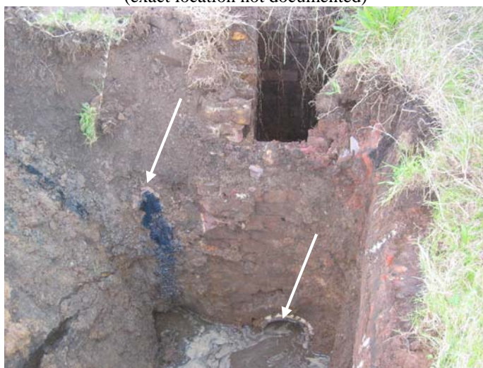
Photo 48 (Aug 06) – Pit located immediately to the south of the existing gasholder