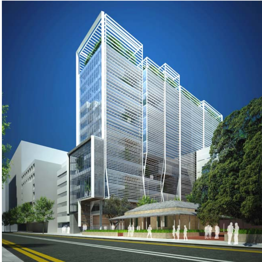
Figure 6 – Proposed commercial building at 89 George Street, as viewed from George Street looking south-east