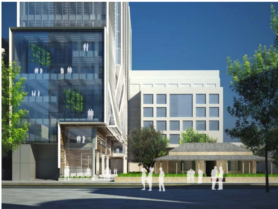
Figure 7 – View of proposed building entry and colonnade off George Street