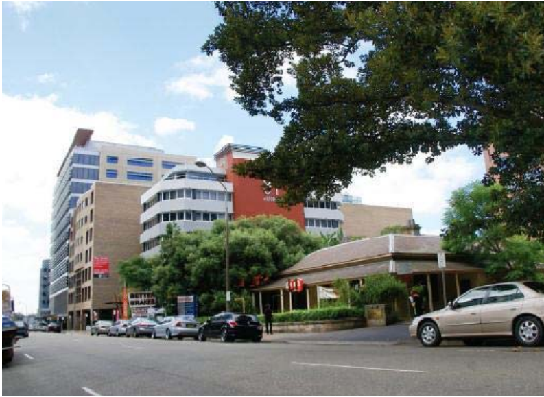
Figure 3 – View of Perth House, 91, 93 & 95 George Street viewed from George Street looking East