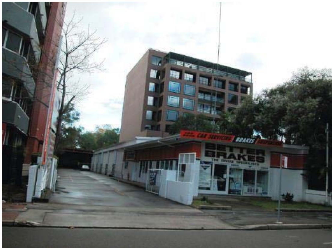
Figure 2 – View of 89 George Street

Photographs of existing development adjoining and near the site are included at Figures 3-5 . Figure 2 below is a view of the site looking south from George Street.