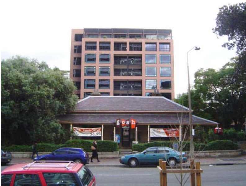
Figure 5 – View of Perth House and office tower to the south (85 George Street)