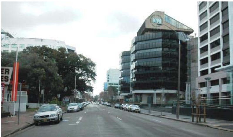
Figure 4 – View of George Street looking West