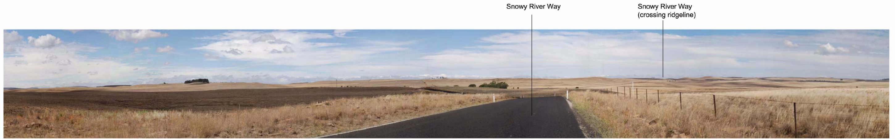
Photomontage Location C - Snowy River Way, existing view north east to south