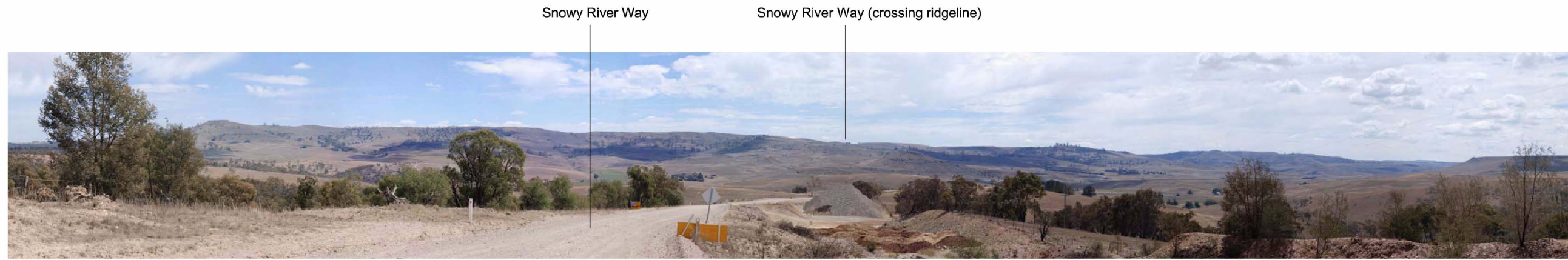
Receptor Location B - Snowy River Way, existing view south west to north east