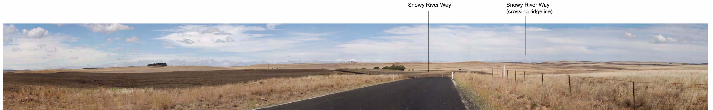
Photomontage Location C - Snowy River Way, existing view north east to south