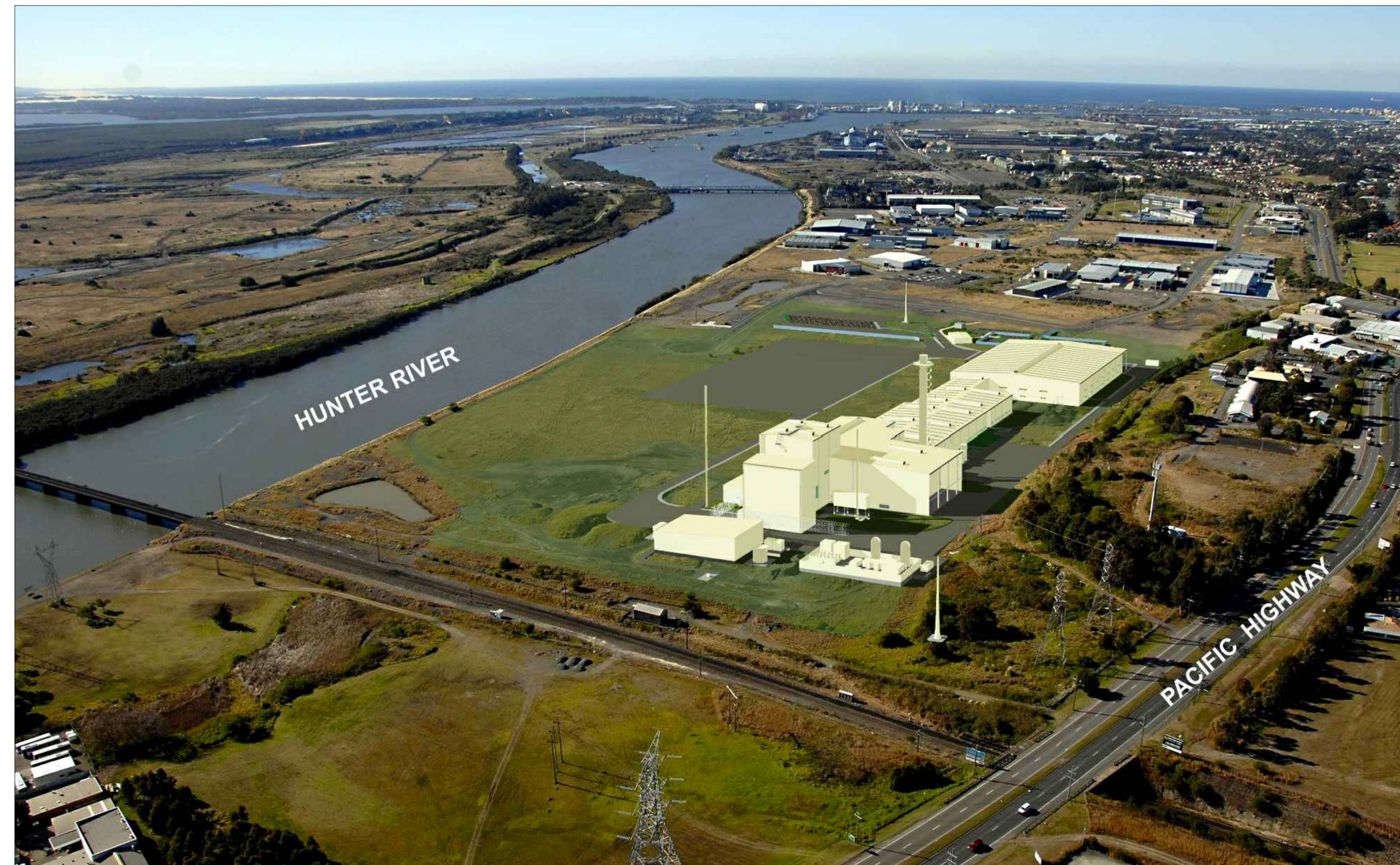
1 Aerial View

GENERAL NOTES: 1. REFER TO MONTEATH & POWYS P/L DRAWING 98136, CAD FILE 98136DW.DWG, SHEET 1, REVISION B FOR EASEMENTS, BOUNDARIES AND EASTINGS' NORTHINGS. 2. REFER TO MONTEATH & POWYS P/L DRAWING 98136, CAD FILE 98136B.DWG, SHEET 1, REVISION A FOR BOUNDARIES ON THE NORTH SIDE OF RIVERSIDE DRIVE. 3. REFER TO CONTROL ENGINEERING DRAWING H61628, REVISION '0' FOR PLANT LAYOUT, SLOPE OF ROOFS AND GRID INFORMATION. 4. GROUND FLOOR SLAB RL: 11.900 AHD TO BE BUILDING DATUM RL: 0.000. 5. LEVELS SHOWN ARE AHD. LEGEND: CONCRETE DRIVEWAY & HARDSTAND CONCRETE PAVERS BITUMEN DRIVEWAY & HARDSTANDS CONCRETE PEDESTRIAN PATH BRICK PAVING PEDESTRIAN PATH GROUND GRAVEL PLANT ROOF