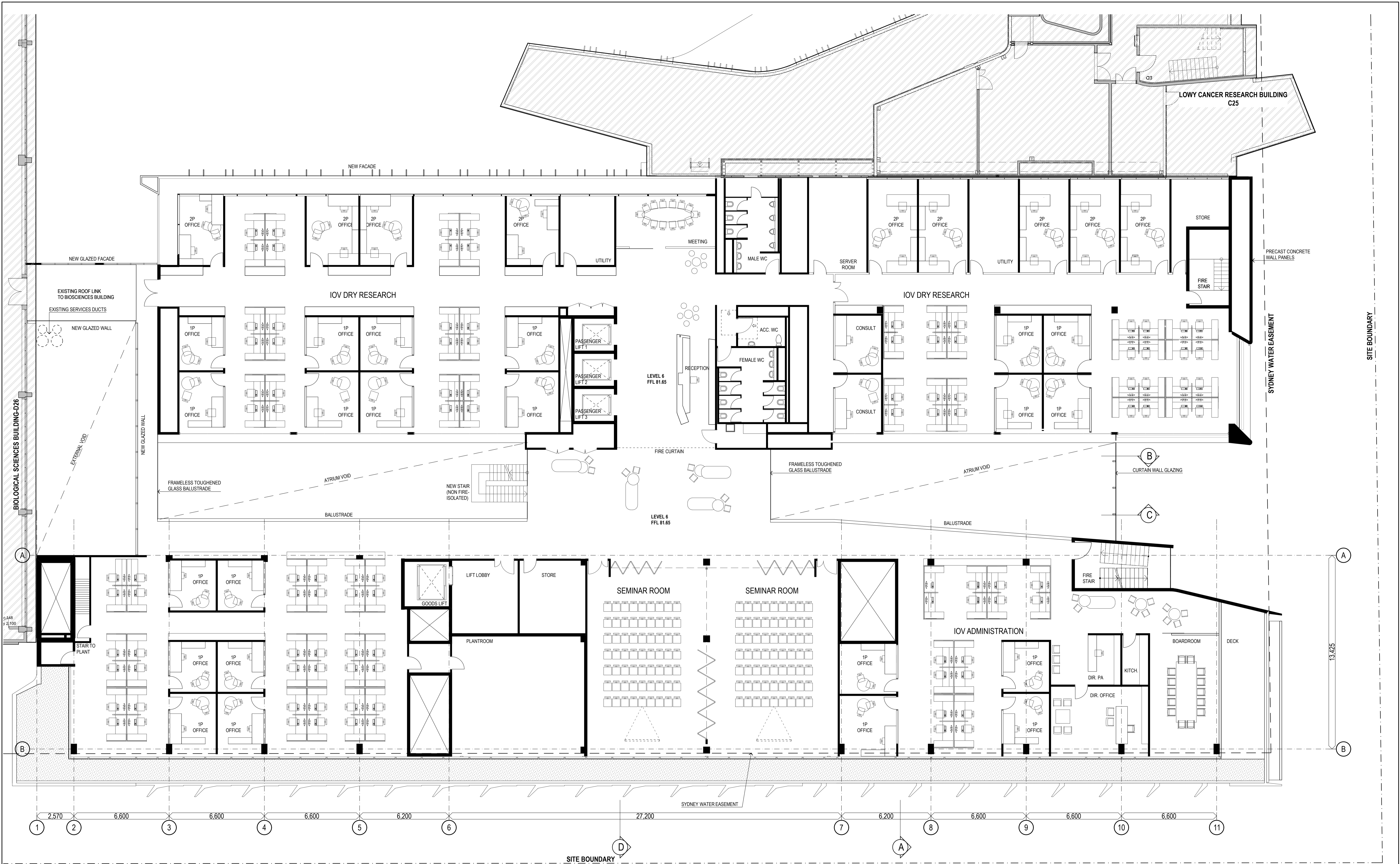
1 Level 6 1:100