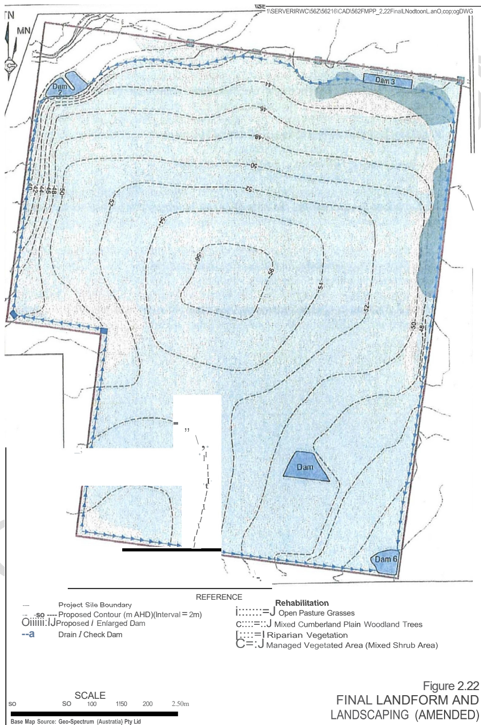
Figure 2.22 FINAL LANDFORM AND LANDSCAPING (AMENDED)