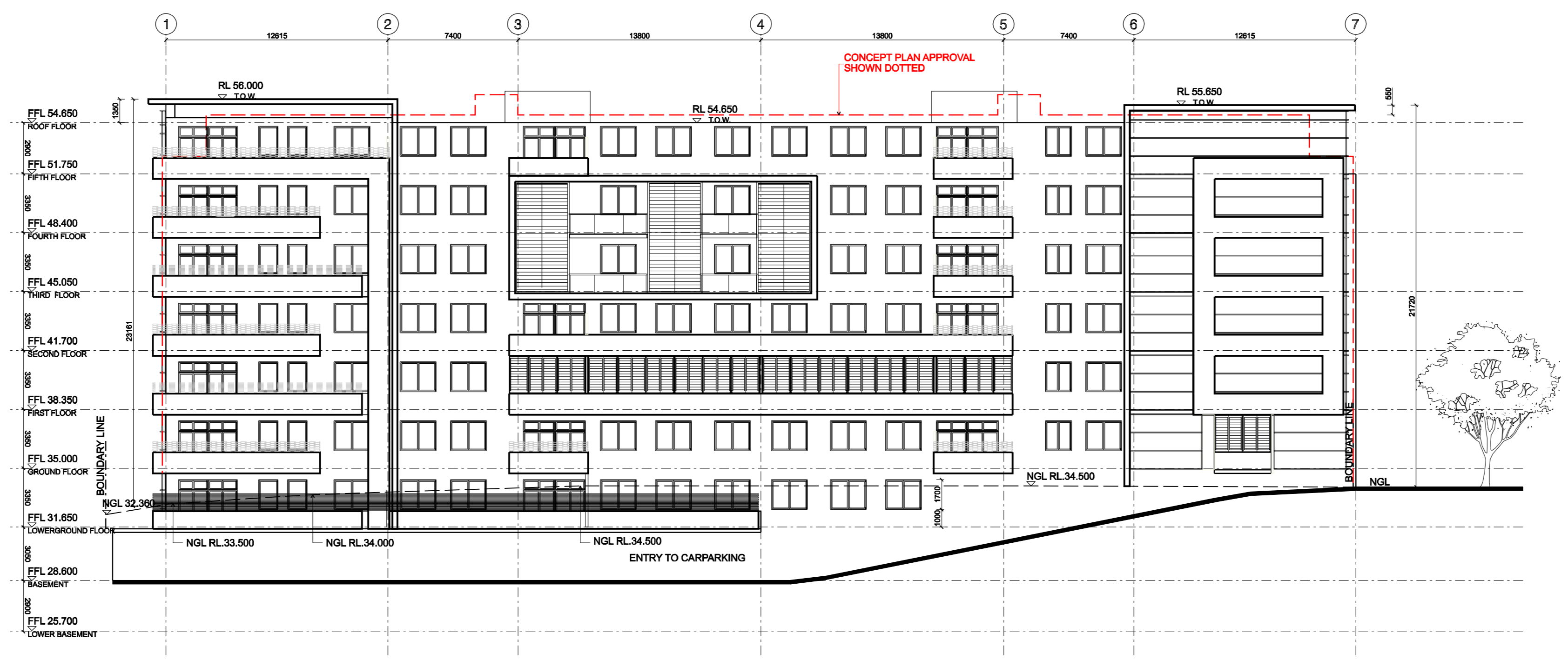
2 SOUTH ELEVATION BUILDING 1 SCALE 1:200