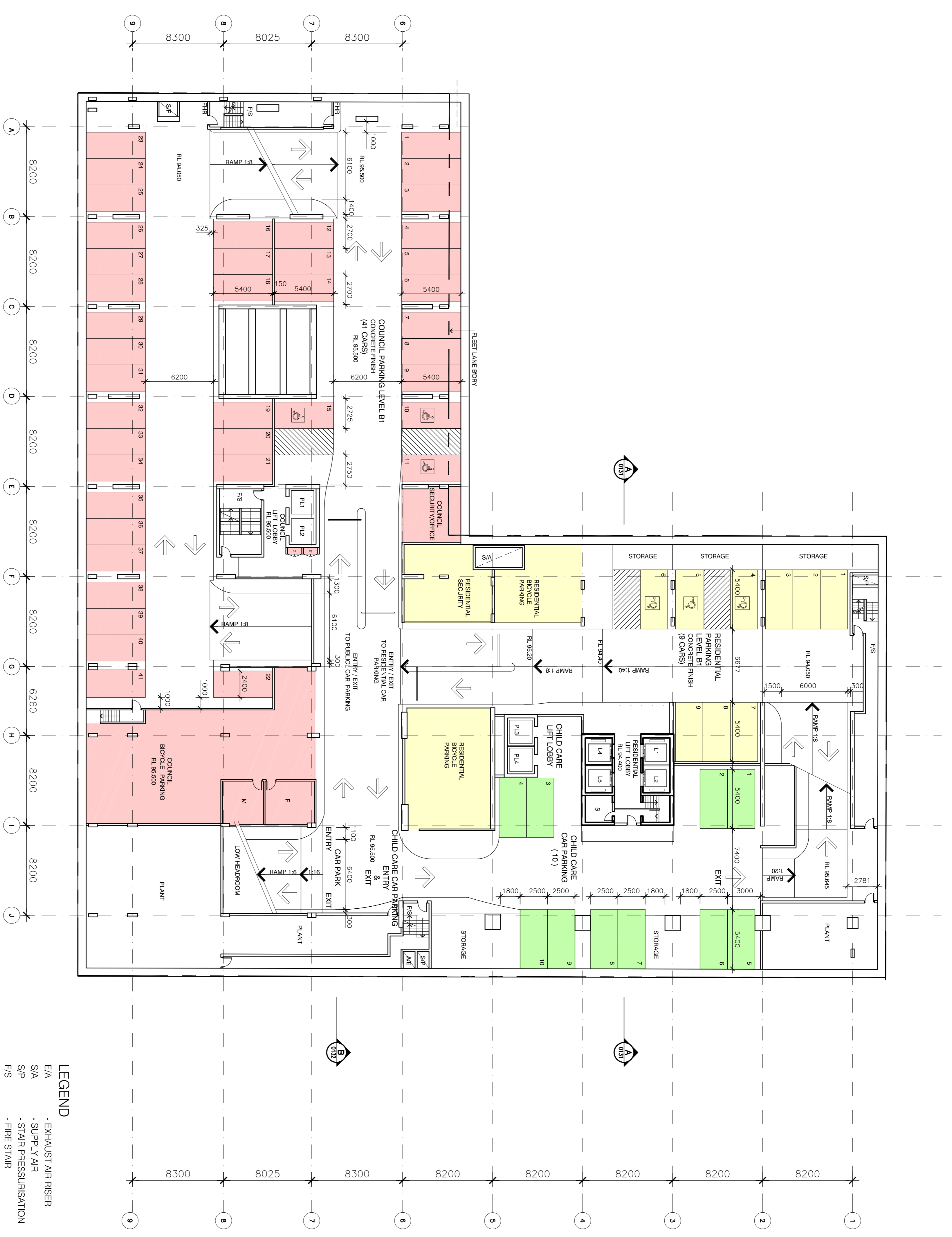
1 BASEMENT 1 PLAN 1:200