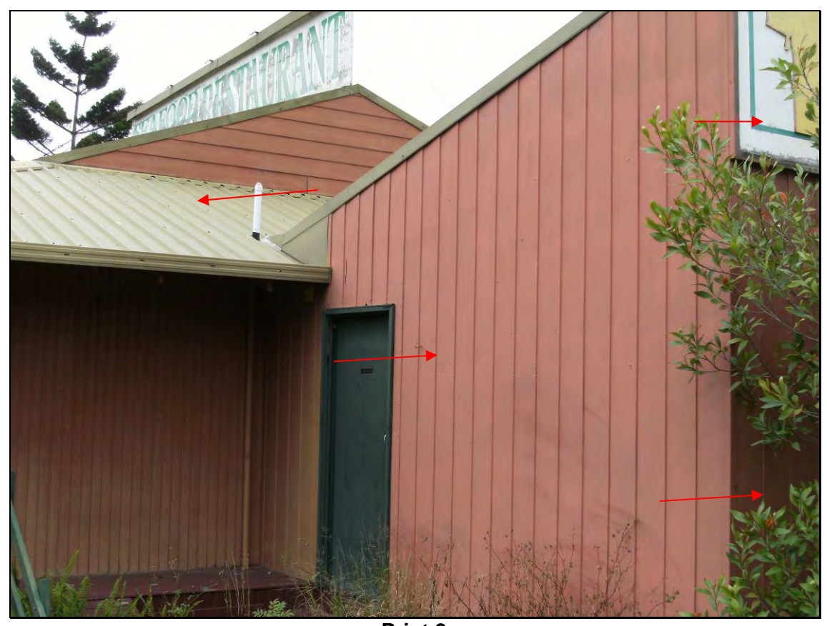
Print 2 Western Section of Restaurant. Note Wall Panels Advertising Sign and Roof