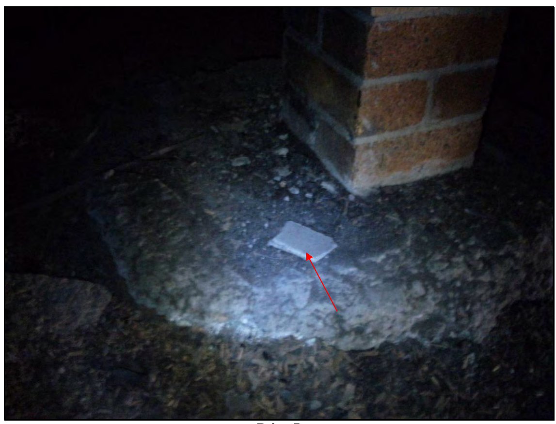
Print 5 Restaurant Subfloor Asbestos Fragment