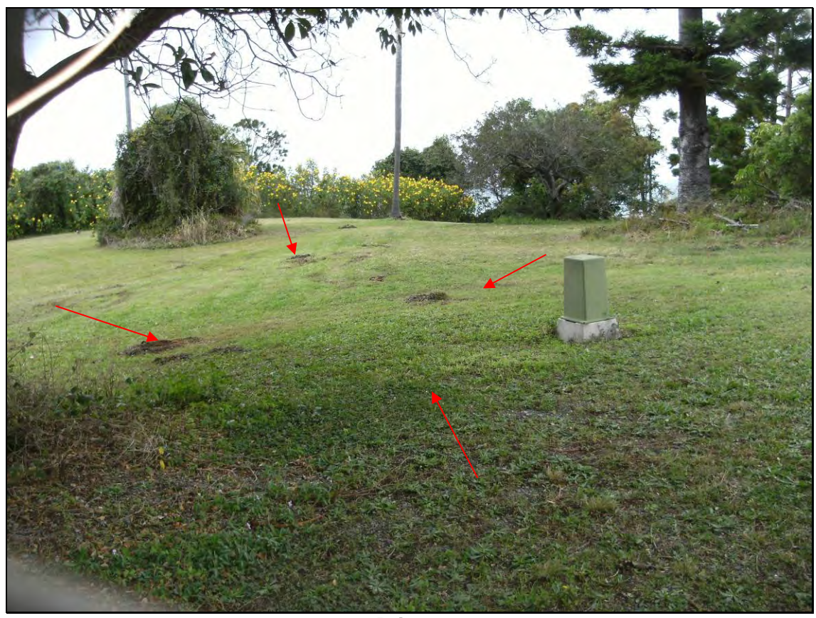
Print 4 Asbestos Containing Fill Area