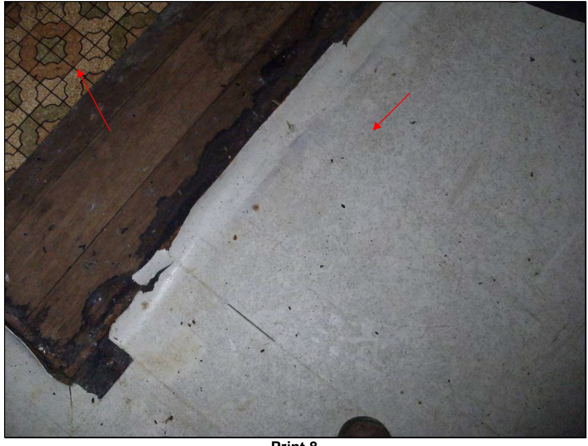
Print 8 Floor Covering within Bar Area