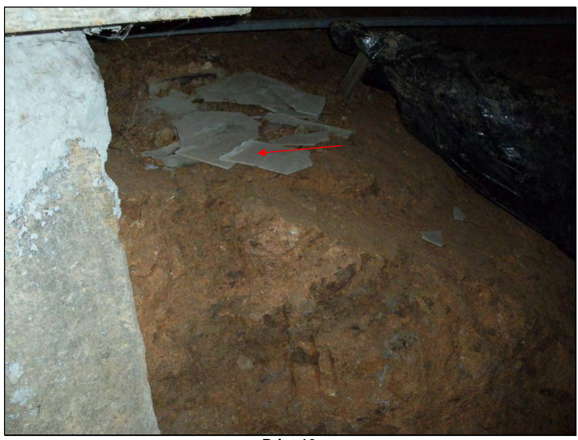
Print 10 Resort Sub Floor Fibro Fragments