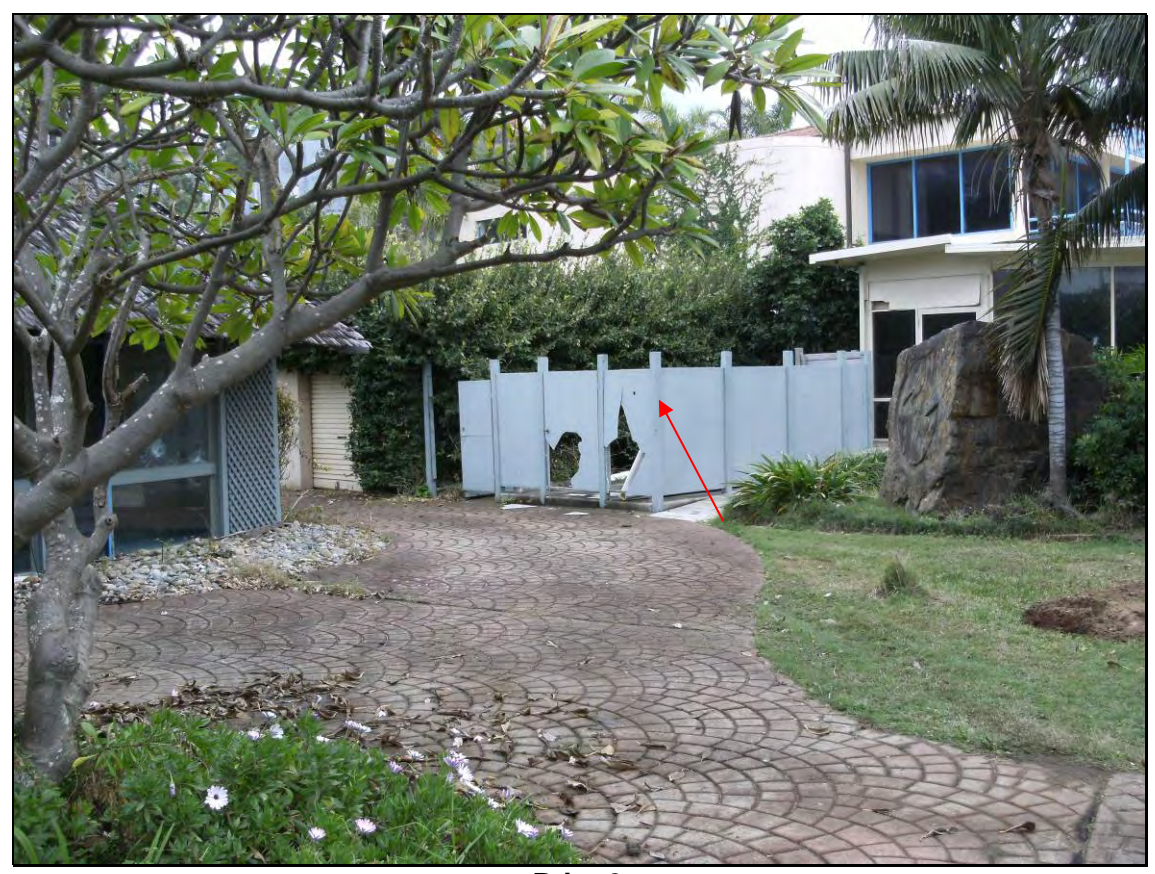
Print 9 Resort Panelling