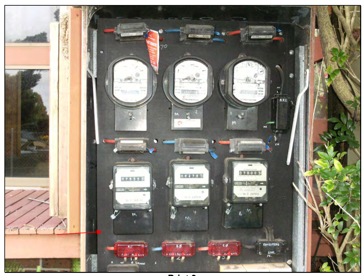
Print 3 Restaurant External Asbestos Containing Electrical Distribution Board