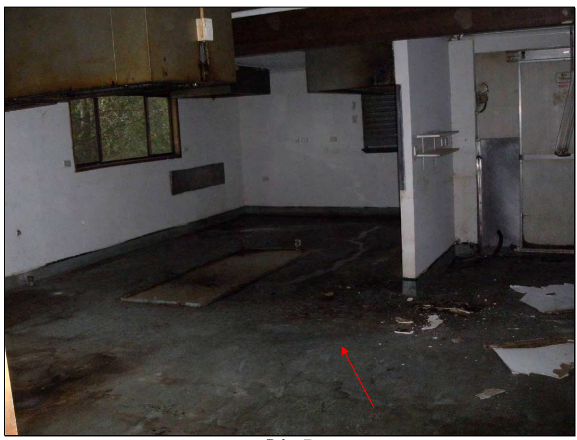
Print 7 Restaurant Kitchen Floor Covering