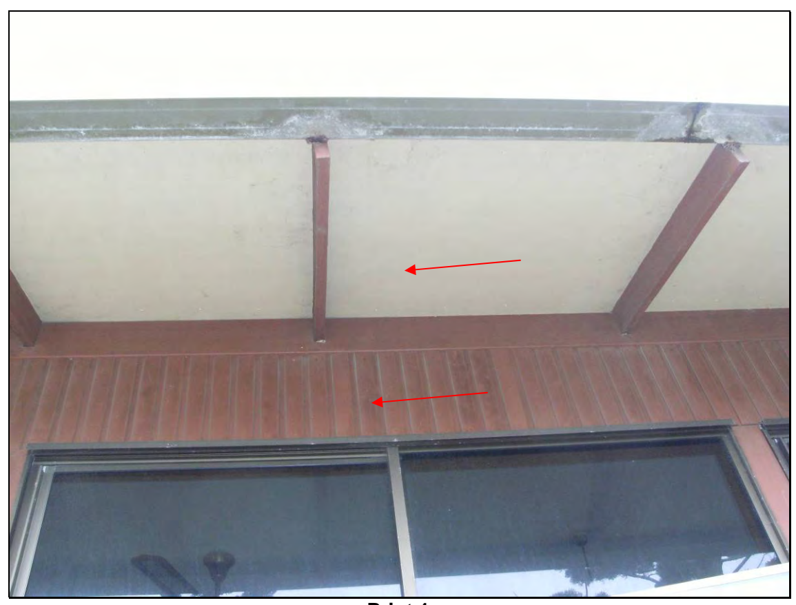
Print 1 Restaurant Eaves and External Wall Panels