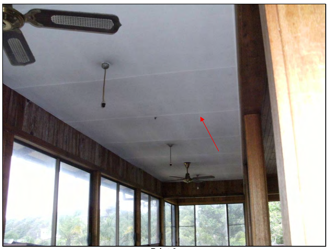
Print 6 Restaurant Asbestos Containing Ceiling