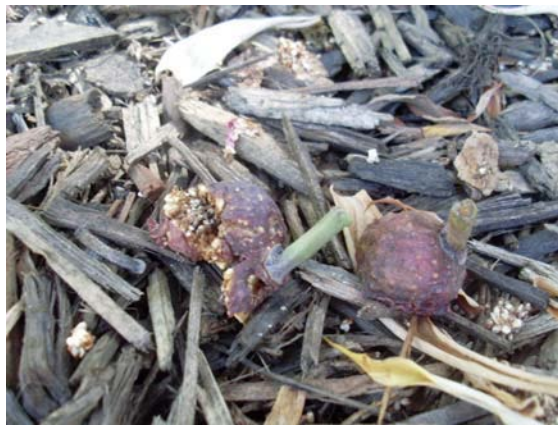
Plate 3.4 Chewed fig fruits