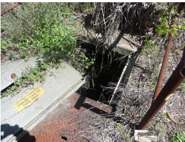
Plate 3.11 Subterranean tunnel