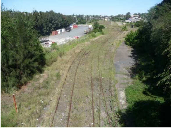
Plate 3.9 Former Rozelle marshalling yards