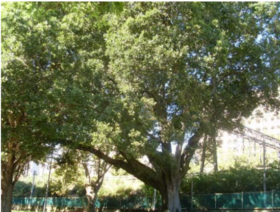
Plate 3.5 Morton Bay Fig