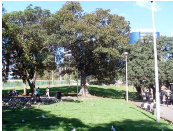
Plate 3.6 Common birds flocking around a bin