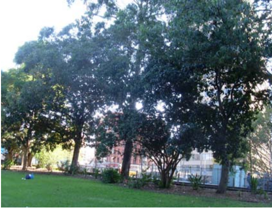
Plate 3.1 Western garden bed