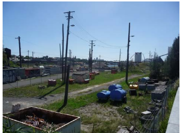
Plate 3.8 White Bay