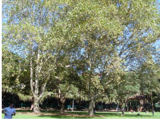
Plate 3.2 London Plane Trees