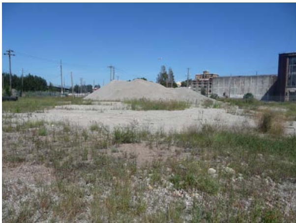
Plate 3.7 White Bay

No bats were detected from within the tunnel and it is considered unlikely to be currently used as a roost site. A Grey-headed Flying-fox was observed foraging in the fruit trees within a residence to the north-west of the site.