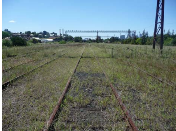
Plate 3.10 Former Rozelle marshalling yards