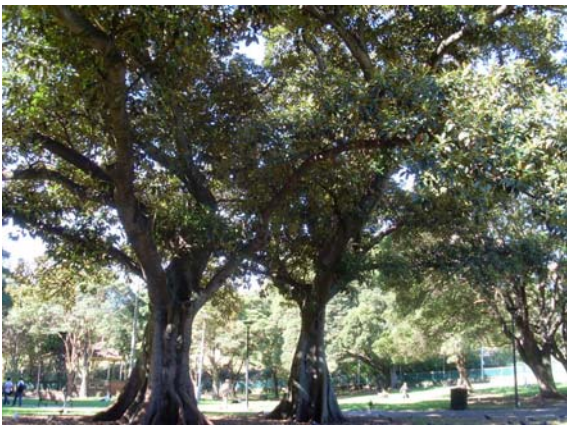
Plate 3.3 Port Jackson Figs