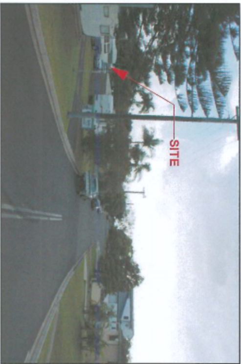
5. VIEW FACING EAST