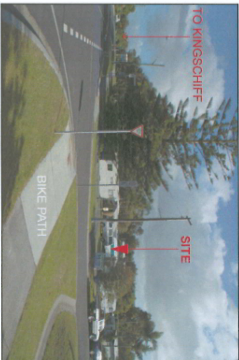
3. VIEW FACING NORTH FROM COAST RD