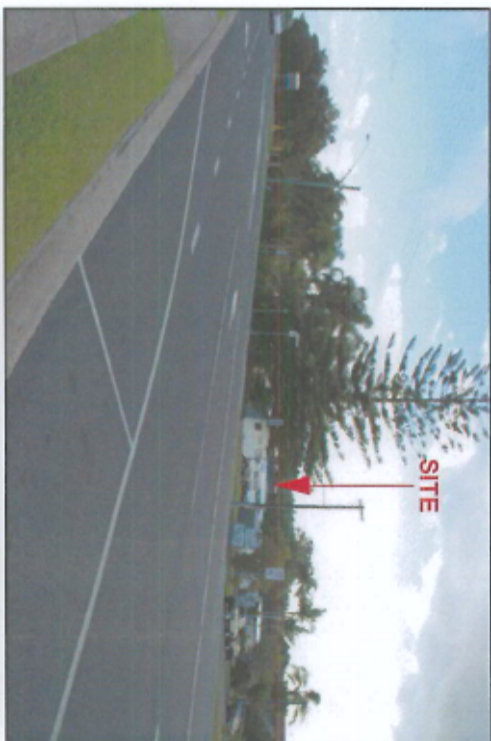
2. VIEW FACING NORTH EAST FROM COAST RD