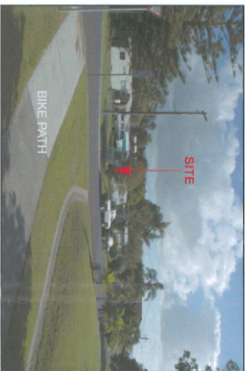
4. VIEW FACING CYPRESS CRESENT