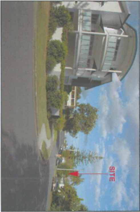
1. VIEW TOWARDS COAST RD FROM CYPRESS CRESENT