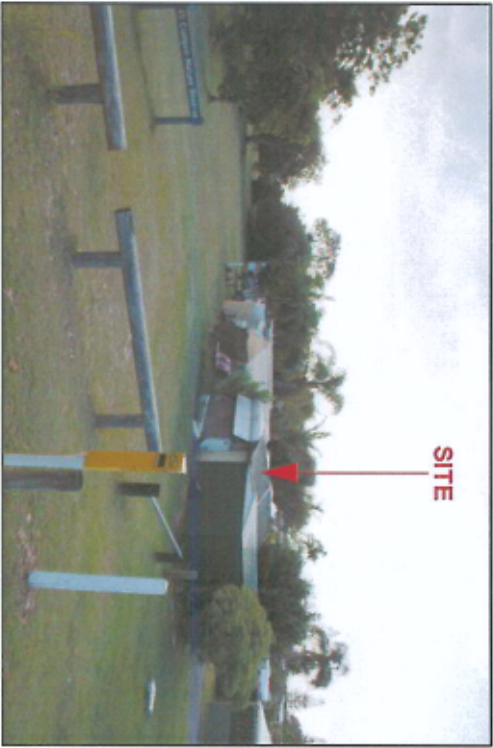
5. VIEW FACING SOUTH-EAST FROM COAST ROAD