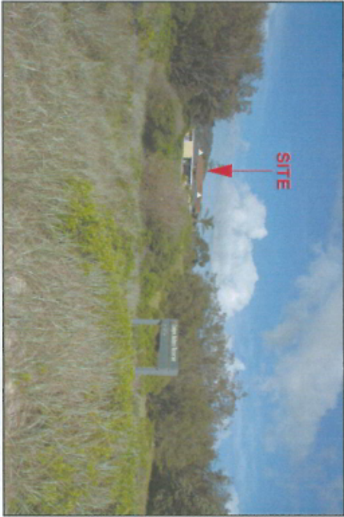
3. VIEW FACING WEST FROM CUDGEN RESERVE