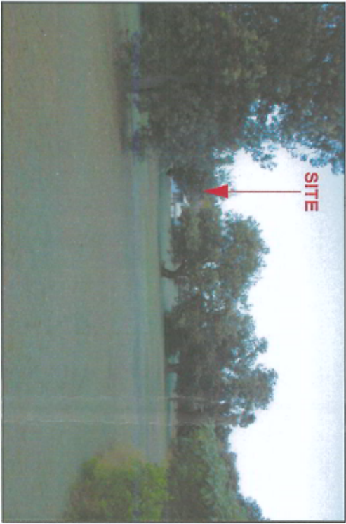
4. VIEW FACING SOUTH-WEST FROM CUDGEN RESERVE