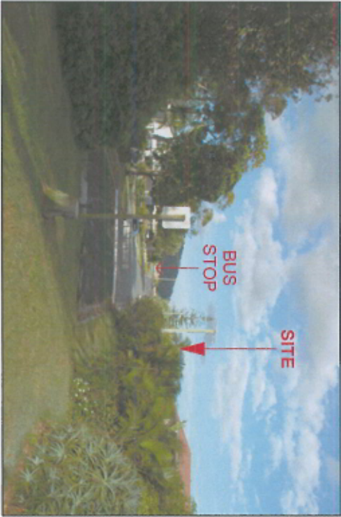
2. VIEW TOWARDS COAST RD FROM CUDGEN RESERVE