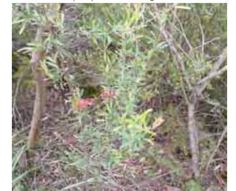
Photo 2.19 Grevillea speciosa