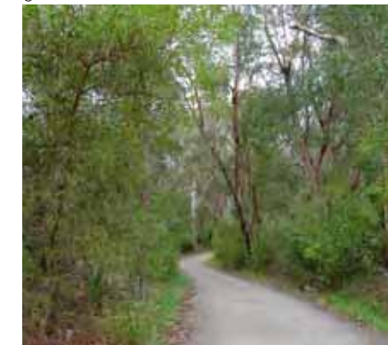
Photo 2.16 Sandstone ridgetop woodland