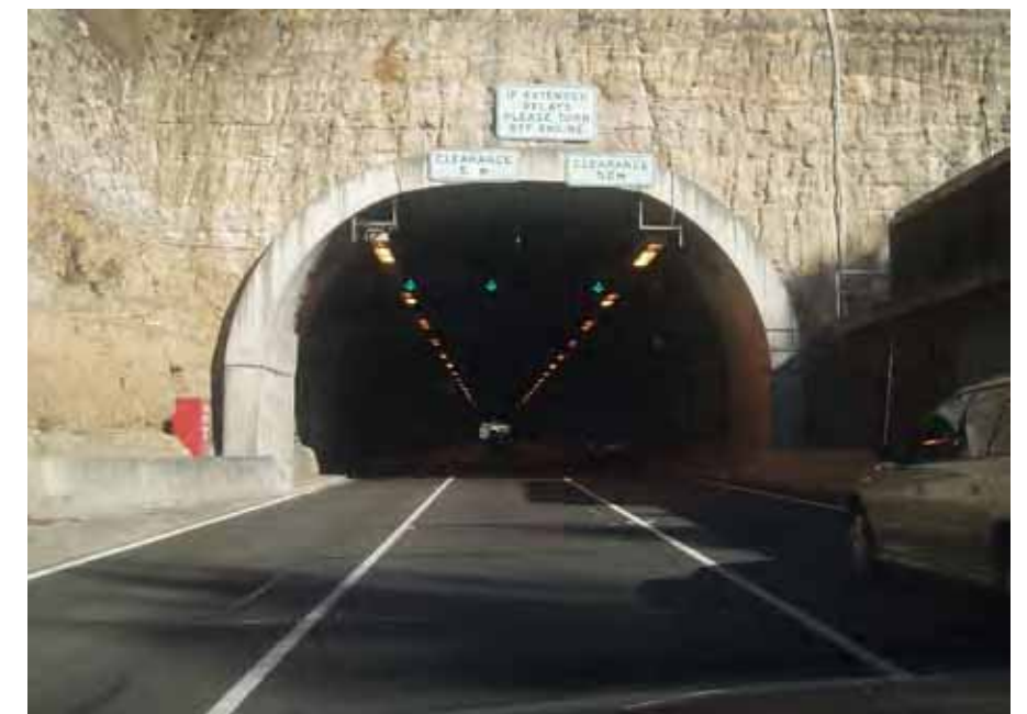
Photo 2.12 Tunnel portal area reveals the local geology

The Lucas Heights landscape is typified by the Mittagong formation which is characterised by interbedded shale, laminate and fine to medium grain quartz sandstone. A small incursion occurs towards the western end at Barclay Road. Soils here are generally of low fertility and nutrient availability, hard setting and stony. The subsoils are occasionally sodic and impermeable. When exposed they are of moderate erodibility. This landscape is located predominantly at the eastern end of the corridor, between Terrys Creek and Delhi Road where the motorway runs along a relatively flat ridge.