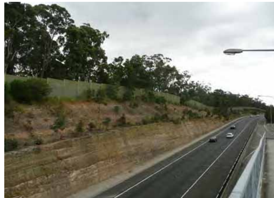
Photo 2.11 Sandstone is exposed in the motorway cuttings

Fertility of soils in this landscape is very low, strongly to extremely acidic, with low to very low nutrient availability. These soils are typically shallow and stony.