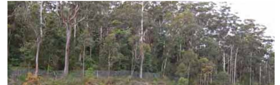
Photo 2.13 Hinterland Sandstone Gully Forest adjoining Kirkhams Street

In moving forward, the upgrade works need to consider the viability of the landscape works within confined zones, the ability to access and maintain the landscape and the role the landscape can play in both improving the character of the corridor by unifying its appearance and relating it back to its natural context.