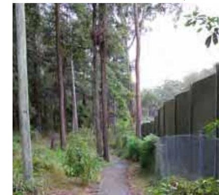
Photo 2.14 Angophora costata and Syncarpia glomulifera