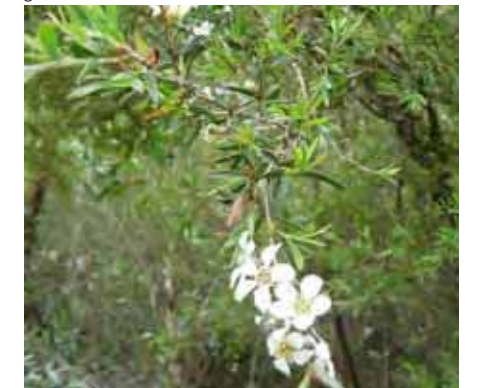
Photo 2.17 Leptospermum laevigatum