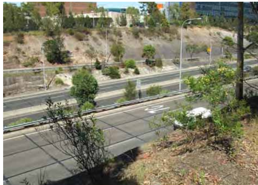
Photo 2.10 Shale seam in sandstone dominated geology

This soil is of low to moderate fertility and is highly erodible.