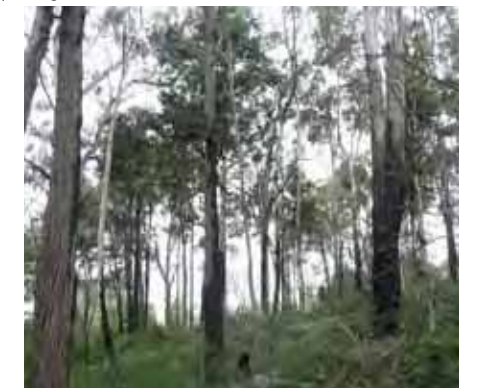
Photo 2.15 Eucalyptus pilularis and Syncarpia glomulifera