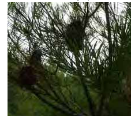
Photo 2.18 Banksia spinulosa