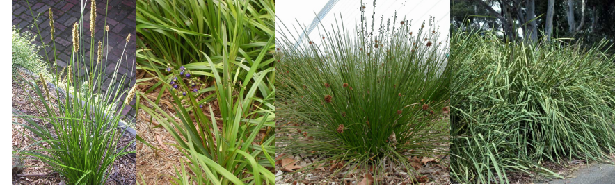
Carex apressa Dianella revoluta Isolepsis nodosa Lomandra longifolia