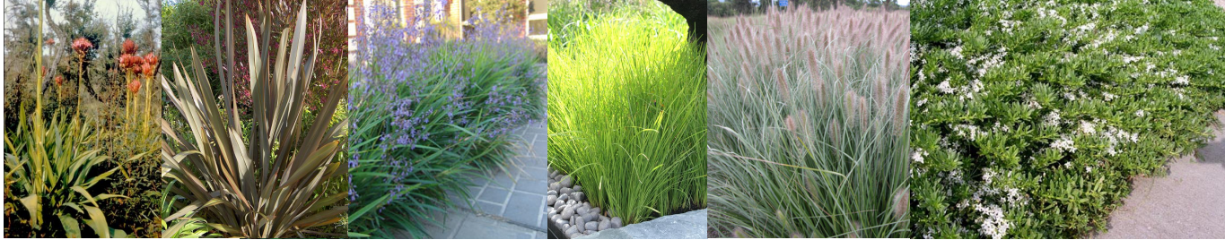
Doryanthes excelsa Phormium tenax Dianella 'Little Jess' Lomandra 'Tanika' Pennisetum 'Nafray' Myoporum parvifolium