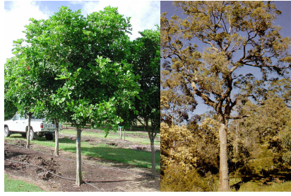
Cupaniopsis anacardioides Angophora floribunda