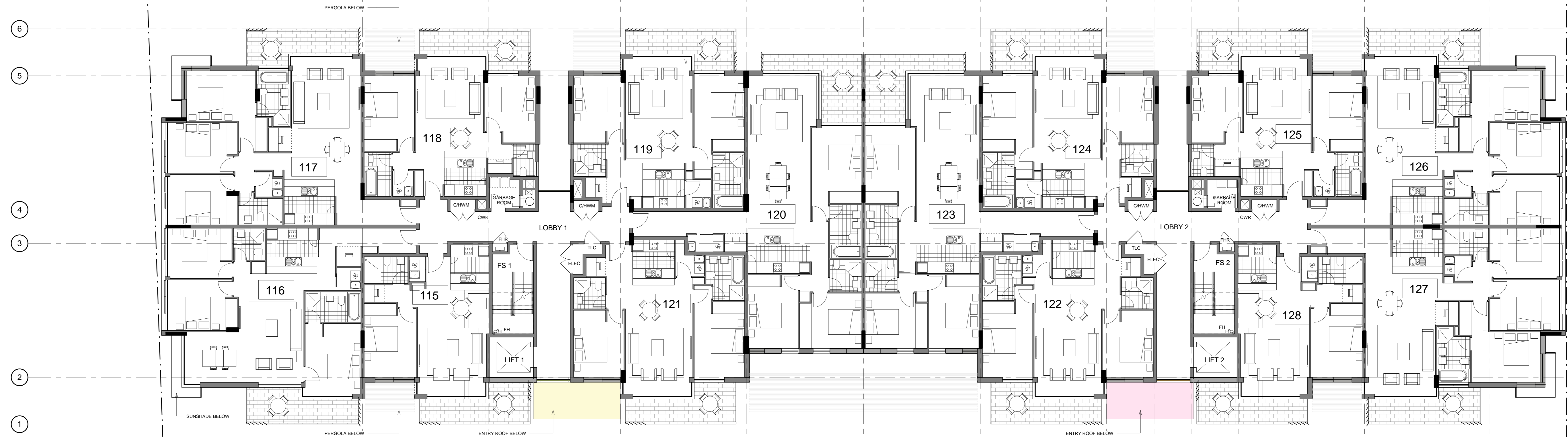
Building 5 L1