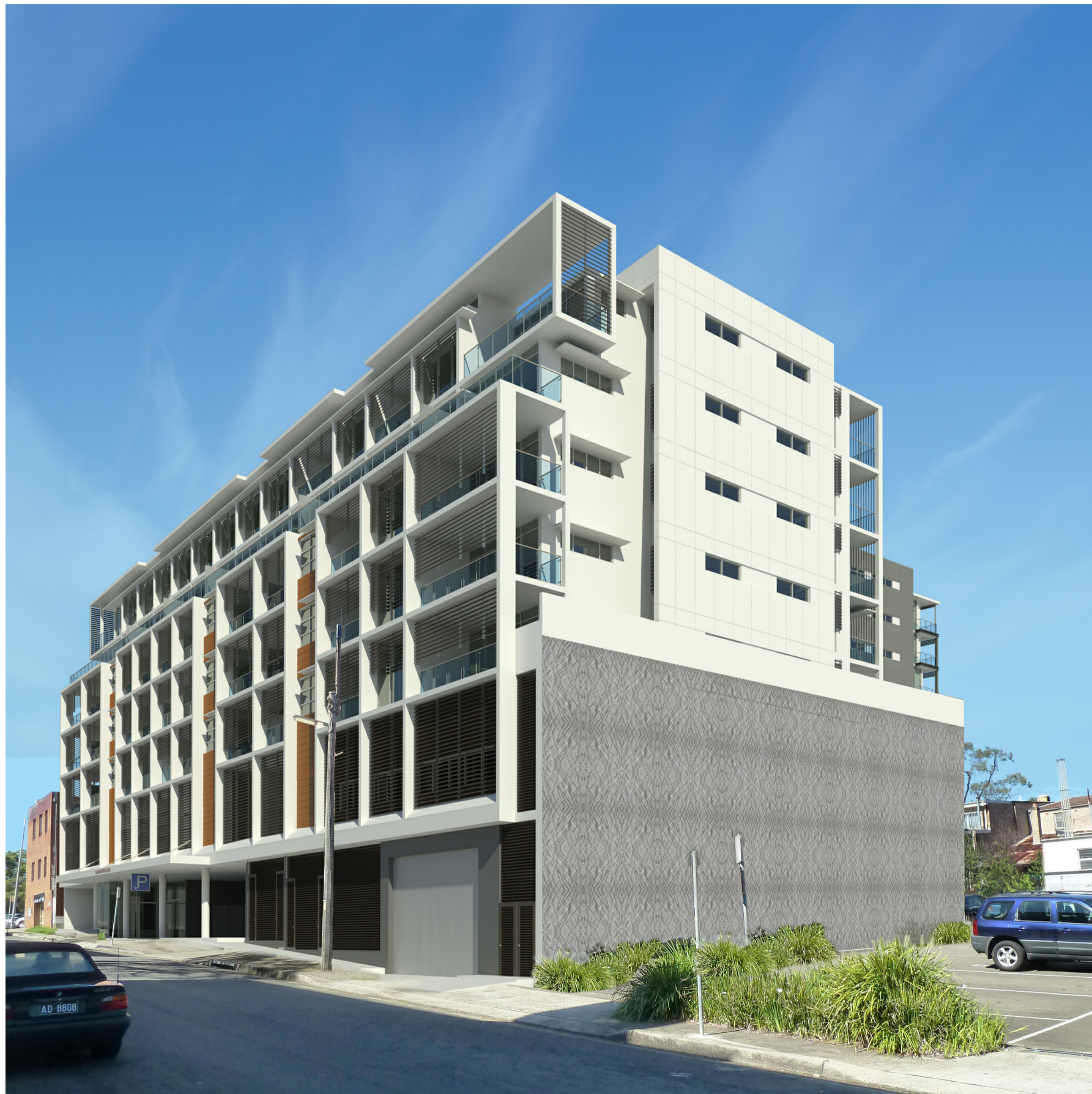
PHOTOMONTAGE 3 ( PROPOSED SCHEME) VIEW FROM HAVILAH LANE