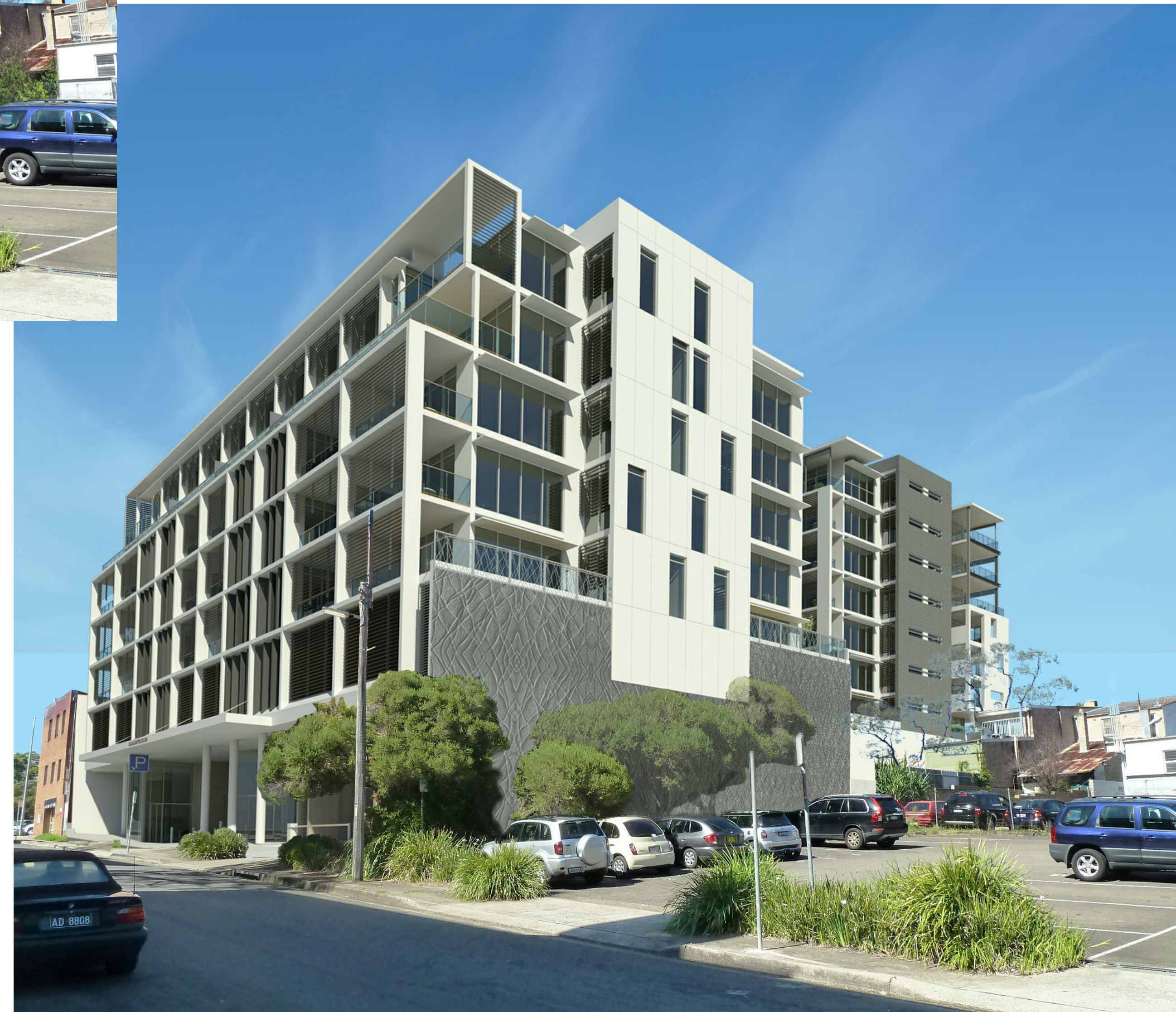
PHOTOMONTAGE 3 (APPROVED SCHEME) VIEW FROM HAVILAH LANE