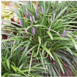
Liriope 'Evergreen Giant'