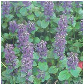
Ajuga 'Catlin's Giant'