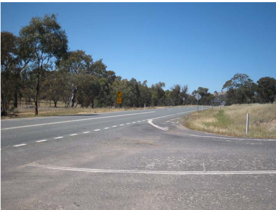
Photo 6: Angle Crossing Road/ Monaro Highway intersection looking south