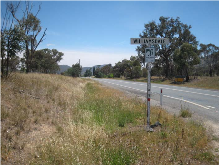
Photo 5: Angle Crossing Road/ Monaro Highway intersection looking north