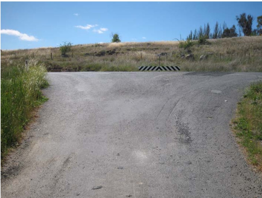
Phot 14: Williamsdale Road looking east at Burra Road intersection