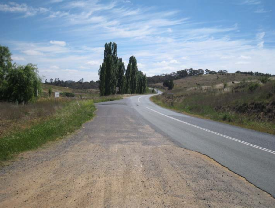
Photo 15: Burra Road northbound approaching Williamsdale Road intersection