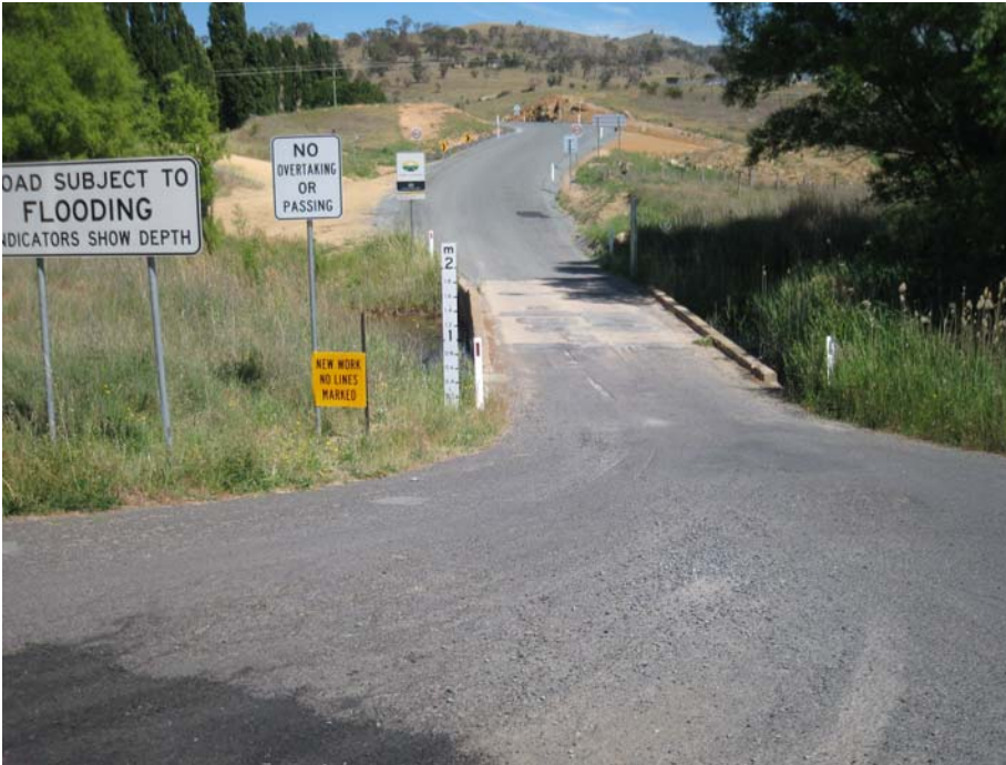
Photo 13: Williamsdale Road looking west from Burra Road intersection