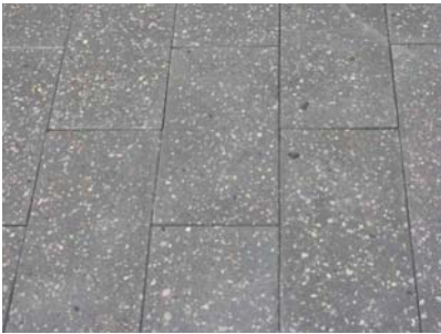
Havenslab - pedestrian paving areas Image: Stockroute Park- photo ASPECT