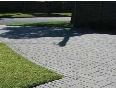
Shared way paving- C and M 'Trupave'