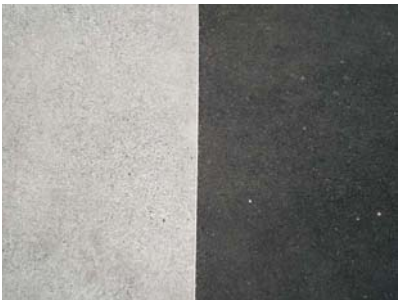
Asphalt paving to the building line AC10.