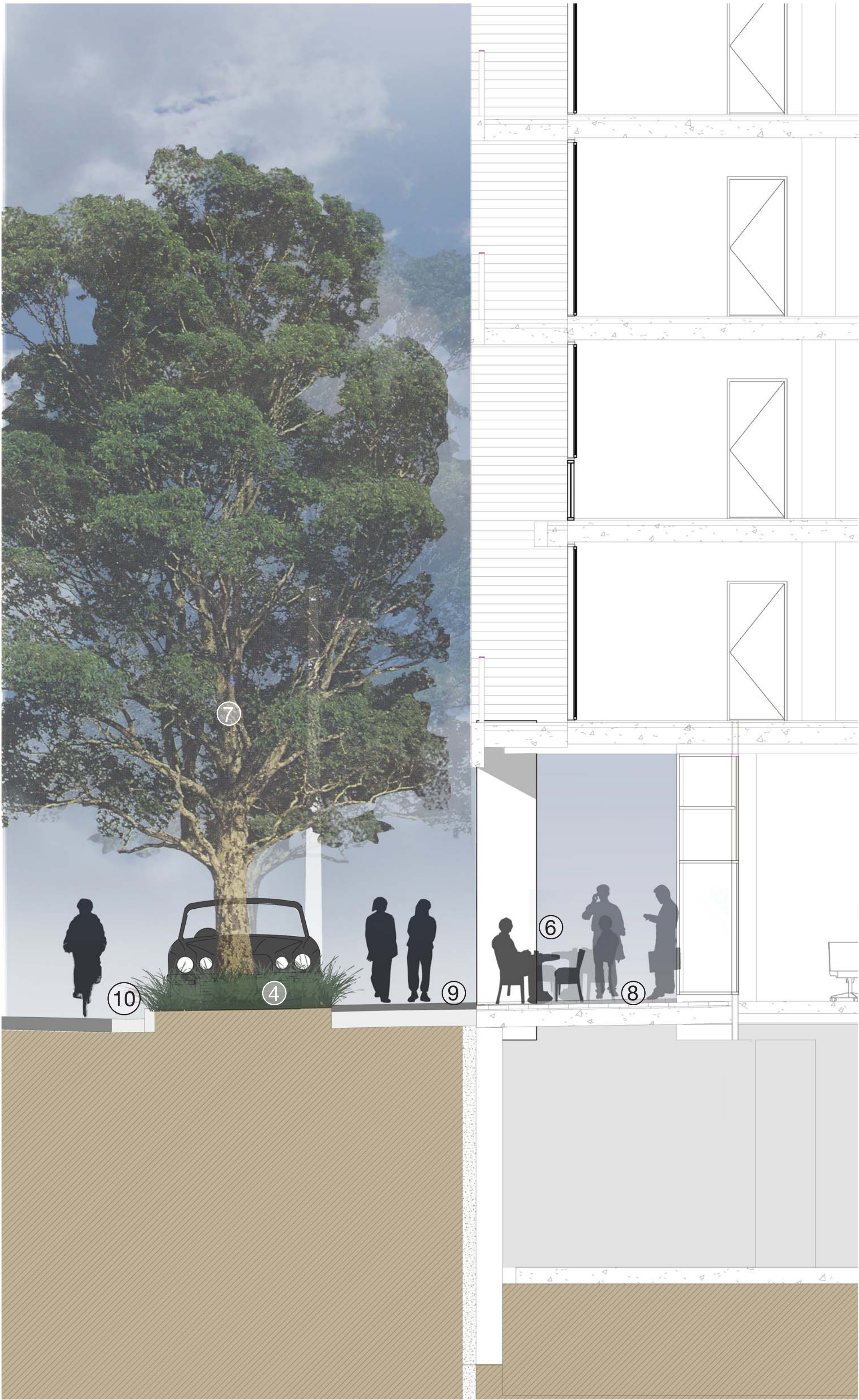
Detail section 01 - colonnade