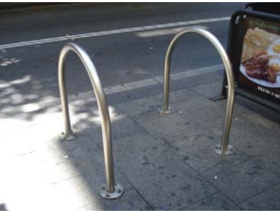
Bike racks.