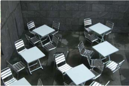
Commercial, non fixed cafe seating.