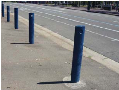
Stainless steel bollards in shared zone. Image: Redfern Park