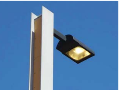
Public Domain Lighting (Light Type 6). Image: SOP Urban Elements Design Manual